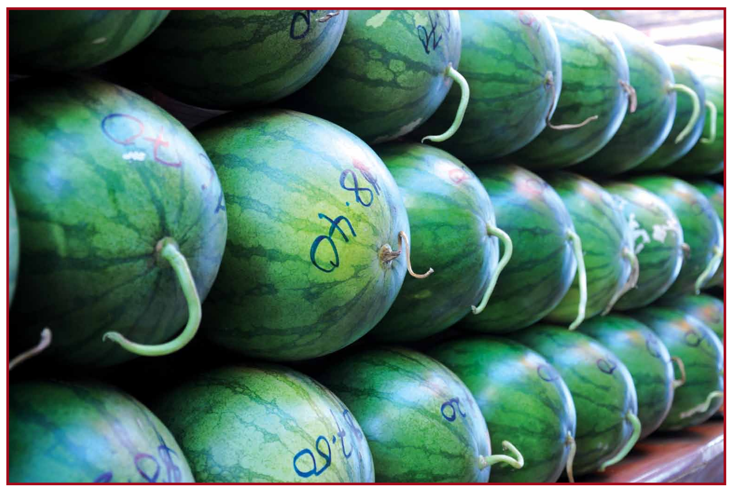
The watermelons are priced according to its weight.

He also expressed his hope that the farming of watermelon will gain more support from the relevant authority; among others is by providing appropriate land or area for farming.