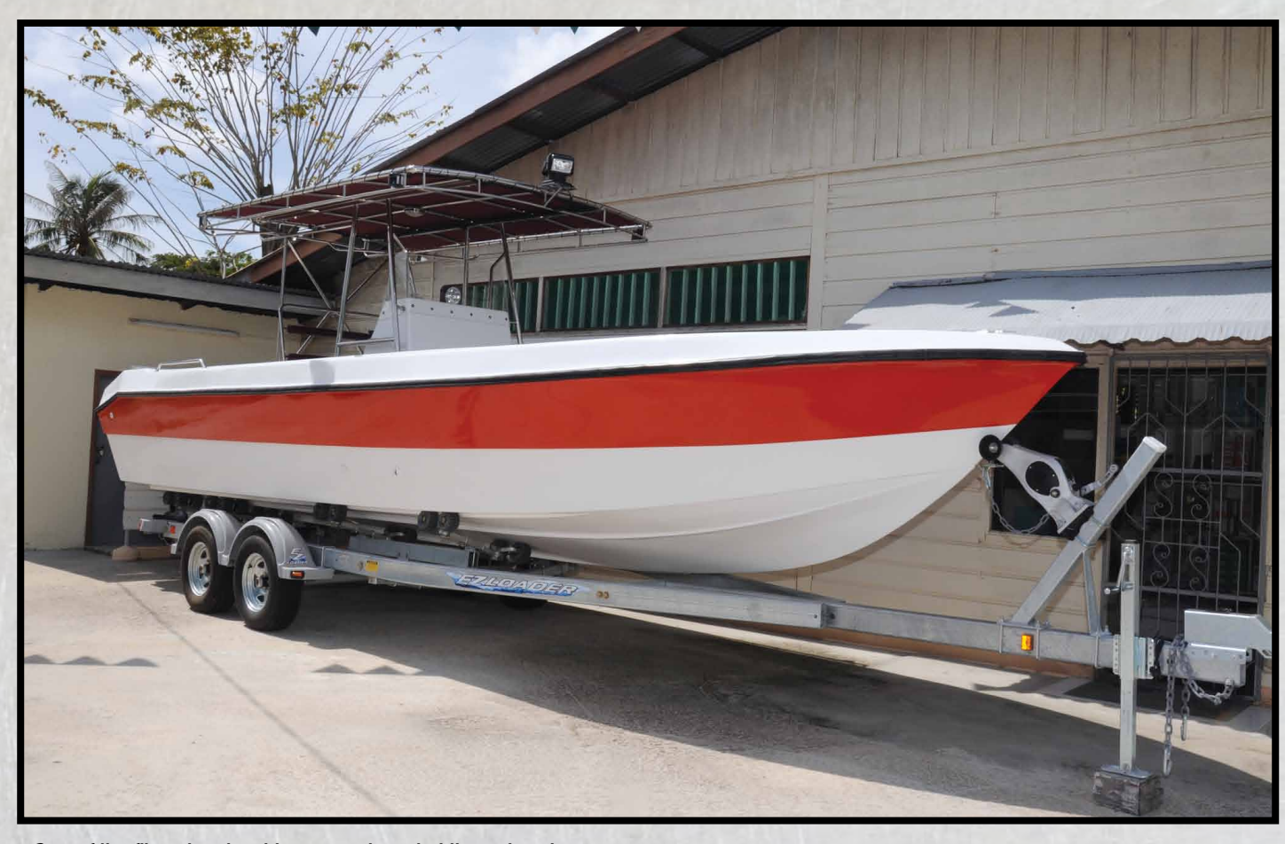
One of the fiberglass boat types produced at the enterprise.