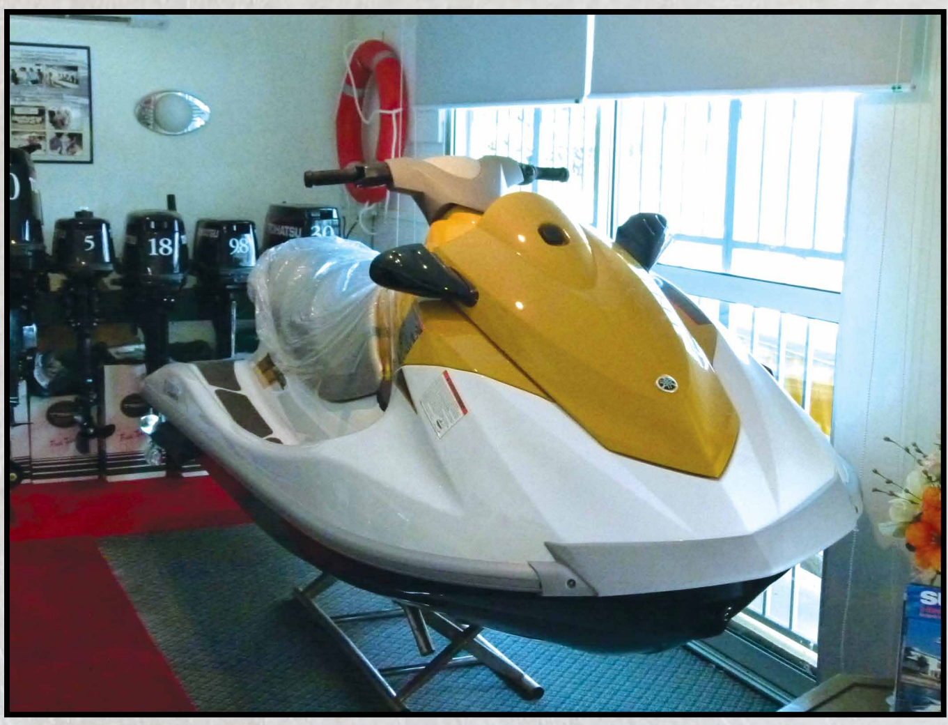
Jet Ski, one of Perusahaan Seri Melati's products.

The establishment of Perusahaan Seri Melati marked a milestone in the country's boat-making industry as the first fiberglass boat enterprise undertaken by local. Its establishment was very well received by public, government and private sectors.