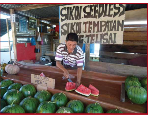
A sample of his watermelon on display at the stall.

The agriculture and agrifood statistic in 2010 showed that based on quantity, watermelon was placed on the sixth position out of 15 in the production of local fruit. In 2010, Brunei Darussalam produced 181,349 kilogrammes of watermelon which had a market value of $232.141.