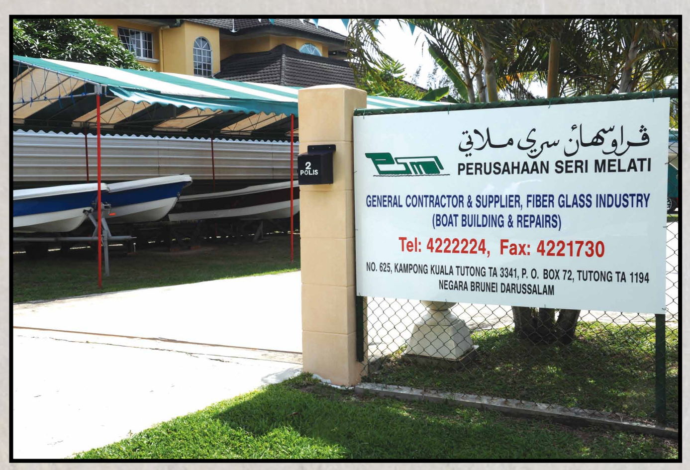
Perusahaan Seri Melati operating at this site since 1979.

At the time, most of the fiberglass boats in Brunei were imported from neighbouring countries as there was no respective enterprise established in Brunei.