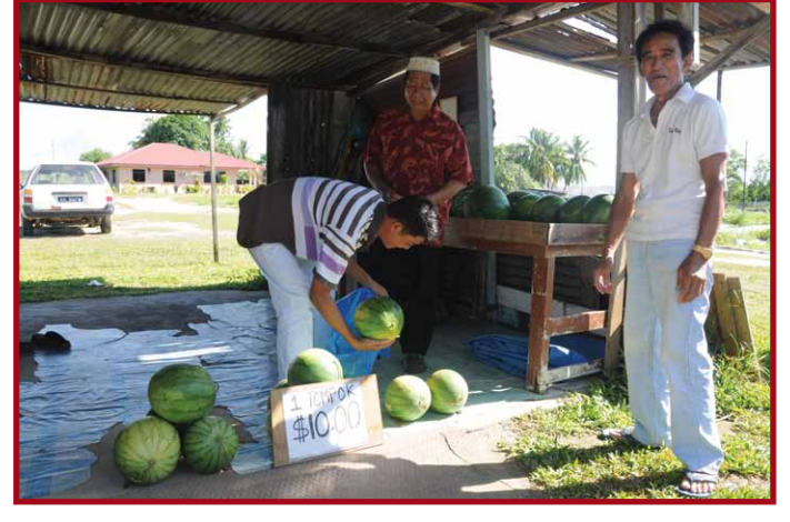
A customer purchasing watermelon.