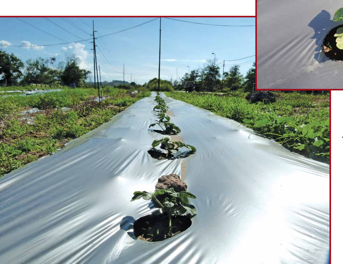
Growing watermelon may take up to 120 days (until harvesting) depending on the location of planting. Pictures show watermelon seedlings.