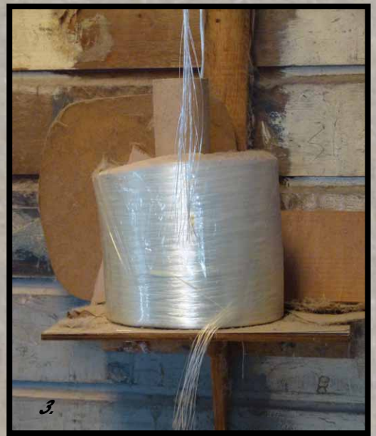
Pictures 1-3: Some of the materials being used in the process of making fiberglass products.