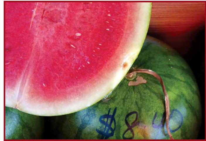
The watermelon rinds are also cooked as vegetables.

She further stated that the major problem is fungal disease especially during rainy and windy season. There was a time where all crops were damaged due to the disease and she needed to replant the seedlings.