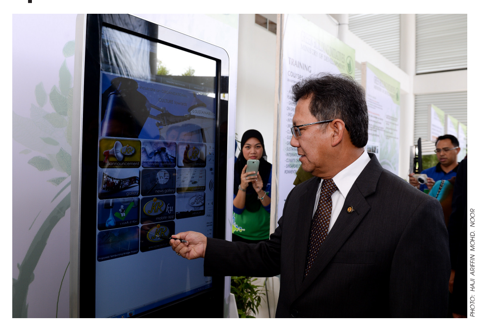
Minister of Development tours the exhibitions being put up in conjunction with the launching of the Energy Efficiency Index.

The PWD has also posted on its website a list of "approved products" that employ energy efficient technology.