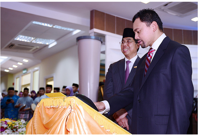
His Royal Highness signed an inauguration plaque.

The building's construction started in 2011 as one of the projects under the National Development Plan.