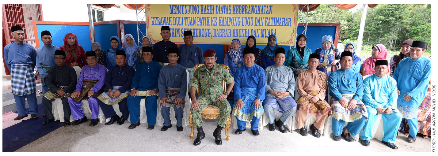
Group picture taking opportunity with His Majesty.