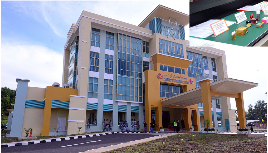
The facade of the MOH Pharmaceutical Service