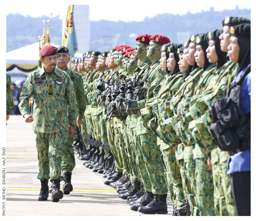
* From frontpage (Royal Brunei Armed Forces celebrate 53rd Anniversary)

the Royal Crest of His Majesty the Sultan and Yang Di-Pertuan of Brunei Darussalam and the Royal Brunei Armed Forces Coat of Arms.