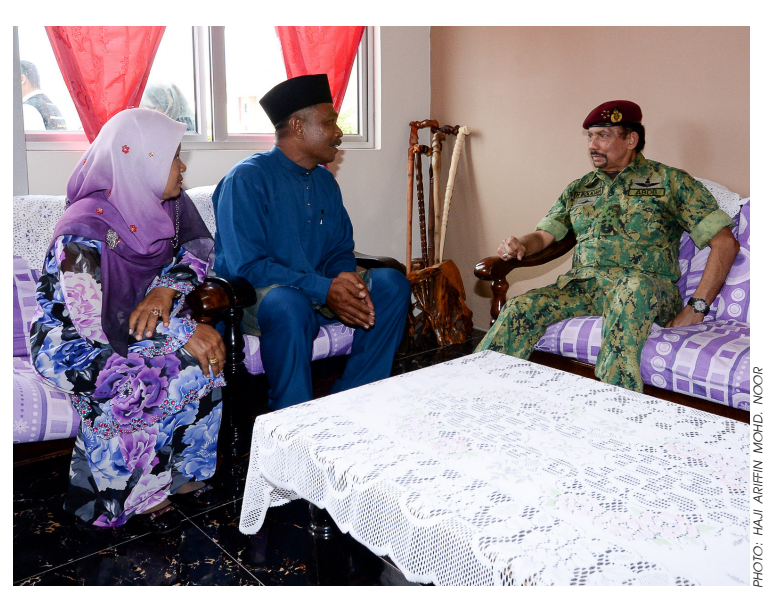
His Majesty also consented to stop over at one of the houses of the recipients.