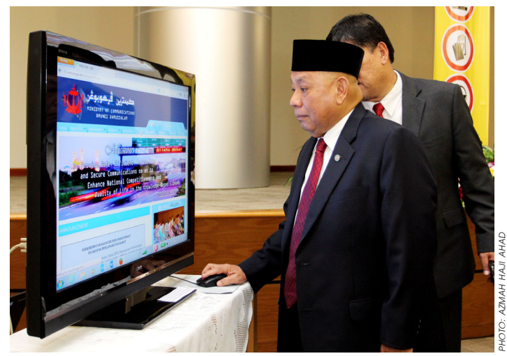
The Minister of Communications at the launching of the Ministry of Communications Safety Week 2014.

In conjunction with the Safety Week, the Minister launched the Ministry's Assets and Safety Unit's website that displays safety aspects in all transport sectors