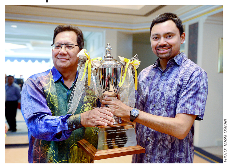
His Royal Highness Crown Prince consented to present the Championship Trophy to the Minister of Development.