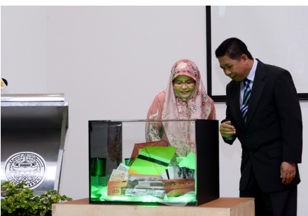
14 Importance of archive to nation's development