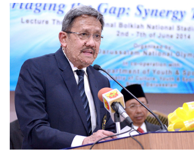
national pride,' says His Royal