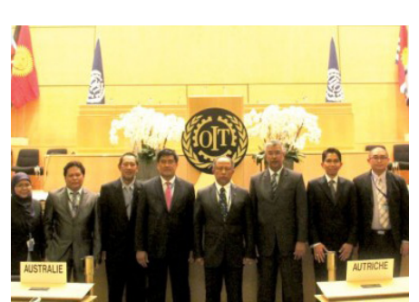
Brunei Darussalam attends 103<sup>rd</sup> ILO conference