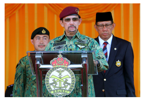
1 Royal's Brunei Armed Forces celebrate 53rd Anniversary