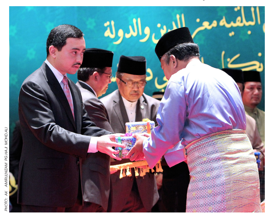
His Royal Highness consented to hand over His Majesty personal gift in the form of dates fruit to one of the Village Heads.