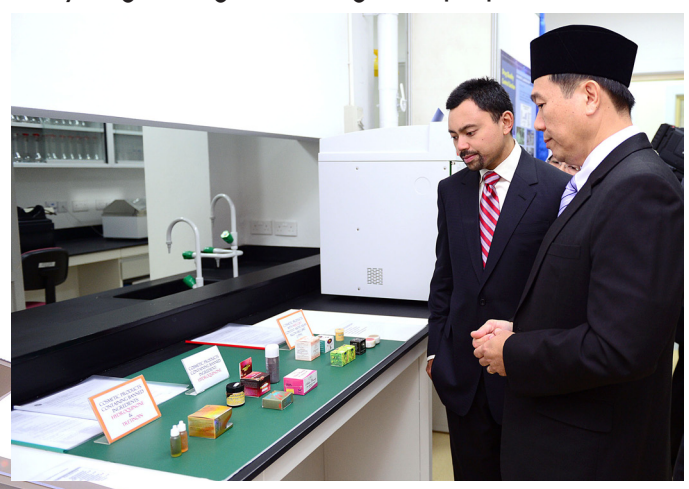
His Royal Highness taking a look at one of the laboratories.