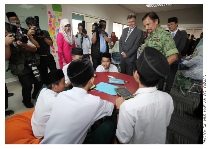
In conjunction with the house keys presentation ceremony His Majesty also consented to visit Institute of Education. Among them are the Sayyidina Husain Secondary School in Jerudong and the Brunei CAE Multi-purpose Training Centre, the Agro Technology Park.