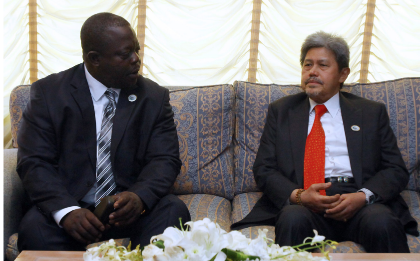
\hbox{His Royal Highness held a bilateral meeting with the Foreign Minister of Gambia.}\\