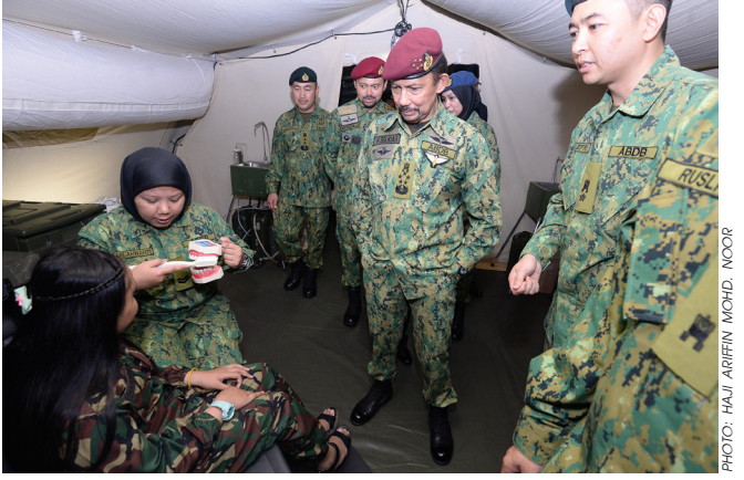
Viewing one of the presentations at the RBAF's Anniversary Celebration.