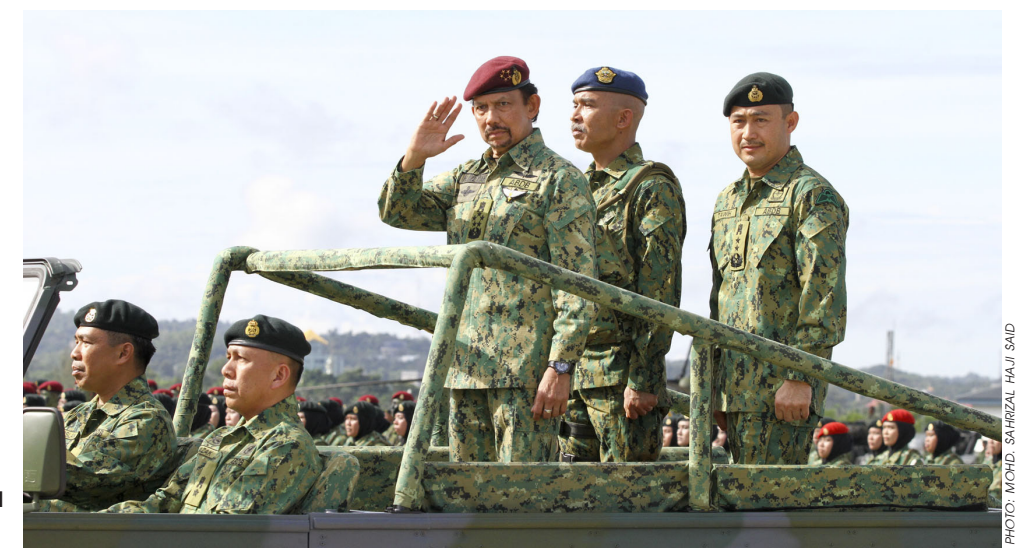
His Majesty inspects the Grand Guard of Honour.