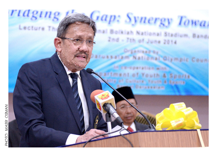
His Royal Highness emphasised the importance of staying away from doping.

The youths attending the five-day seminar are expected to represent Brunei Darussalam at future South East Asian or SEA Games and the Asian Games.