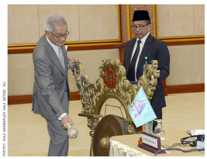
The Speaker of Brunei Darussalam's Legislative Council launched the ASEAN Inter-Parliamentary Assembly.