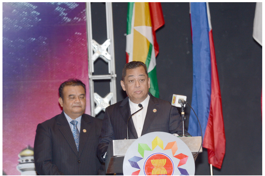
The Minister of Energy at the Prime Minister's Office officiated the 14^{\rm th} SOMTC

14<sup>TH</sup> SENIOR OFFICIALS MEETING ON TRANSNATIONAL GRIMS (SOWITG) AND ITS RELATED MEETINGS 22 - 27 JUMS 2014, BANDAR SERI BEHAWAN, BRUNEI DARUSSALAM