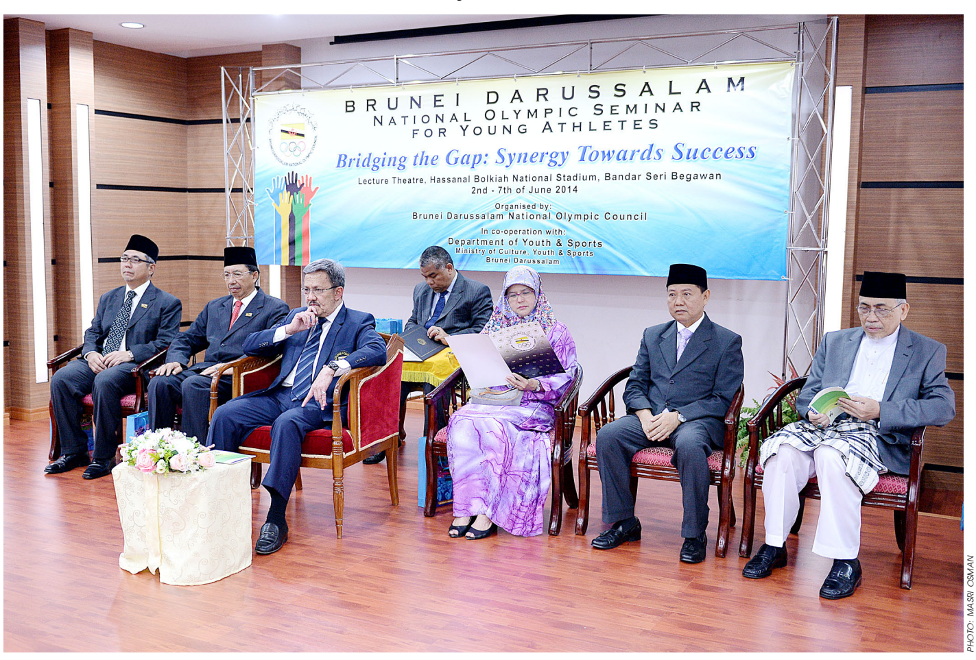
His Royal Highness officiated the five-day seminar.