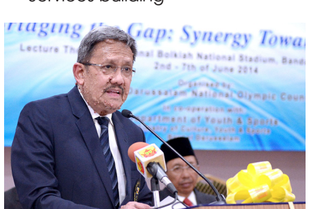
12 'Be a clean athlete and be a