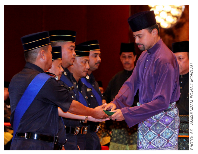
His Royal Highness Crown Prince, the Deputy Sultan presents Medal of Honour to one of the recipients

Pengiran-Pengiran Cheteria, Ministers, Members of the Legislative Council, Deputy Ministers, Pengiran-Pengiran Peranakan, Pehin-Pehin, MPs, MPs Interior, High Commissioners, Ambassadors, Permanent Secretaries, heads of departments, senior government officials, penghulus and village heads were also present at the ceremony.