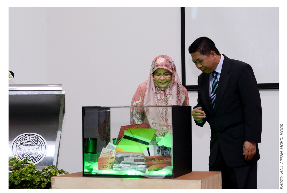
Datin Paduka Hajah Adina Othman, the Deputy Minister of Culture, Youth and Sports officiating the International Archives Day.

The Deputy Minister hoped that through the International Archive Day