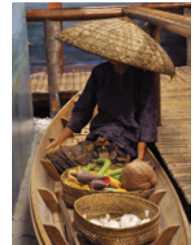
Exhibition statue of a trader known as "Padian"

Situated along the river banks of Brunei River at Jalan Kota Batu, the Brunei Museum showcases the origins of Brunei's culture and heritage. A walking distance away is the Malay Technology Museum where it offers an insight into the kind of tools ancient Bruneians used for their daily routine particularly for the cottage industry. The museum features goldsmith techniques, boat-making, fishing, brasssmith, and woodworks, as testaments to the ingenuity which earlier generations utilised available materials and resources.