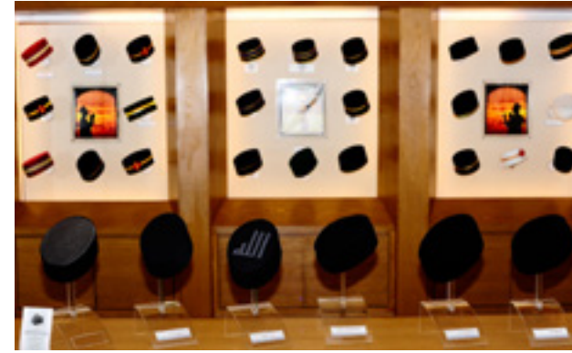
Songkok collection displayed at the Brunei Arts & Handicrafts Training Centre

The mausoleum is situated at Jalan Kota Batu facing the Brunei River. The tomb of Sultan Bolkiah, the fifth Sultan of Brunei lies within the mausoleum. Sultan Bolkiah was one of the greatest Sultans of Brunei, known as Nakhoda Ragam which means 'The Singing Captain'. During his rule, Brunei's sovereignty extended over the whole of the coastal kingdom of Borneo. The mausoleum, therefore, commemorates the golden age of Brunei.