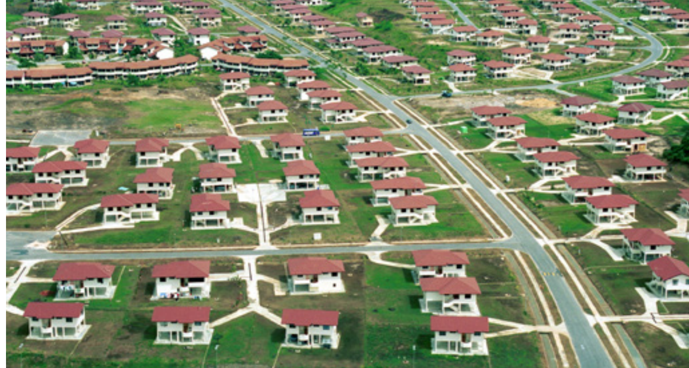
One of the Housing schemes introduced

The resettlement programmes began as early as 1951 when the residents of Kampung Bendahara Lama of Kampung Ayer were resettled to the Bunut Resettlement Area in Mukim Kilanas of the Brunei-Muara District.