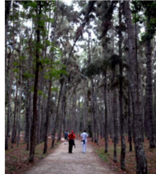
Bukit Shahbandar Forest Recreational Park