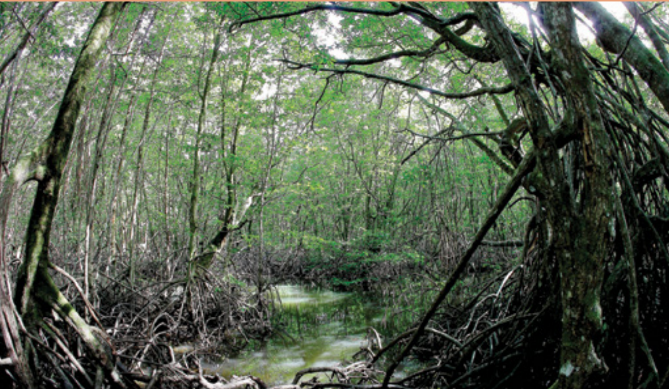
About 76 per Cent of Brunei Darussalam's total land area is covered with rainforest