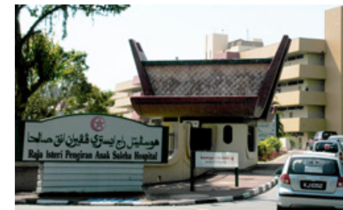
Hospital Raja Isteri Pengiran Anak Saleha

Statistics showed that the three major cause of death in 2016 was Cancer (Malignant Neoplasms) - 353 people; followed by heart diseases (211 people); and Diabetes Mellitus (149 people). Other major causes of death include