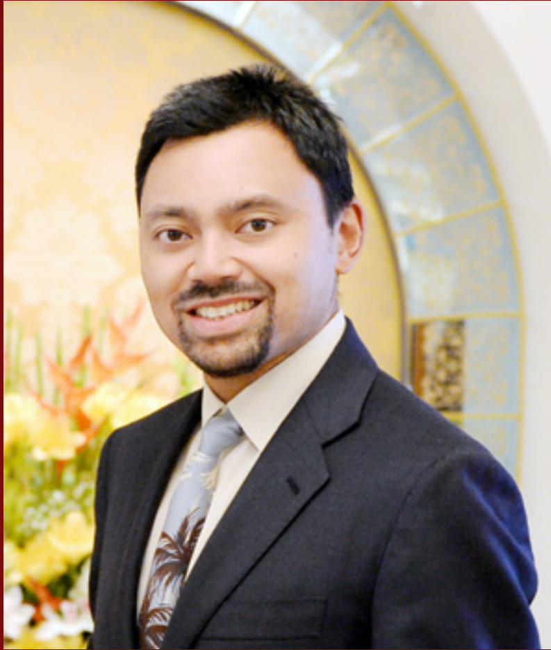
His Royal Highness Prince Haji Al-Muhtadee Billah ibni His Majesty Sultan Haji Hassanal Bolkiah Mu'izzaddin Waddaulah, The Crown Prince and Senior Minister at the Prime Minister's Office