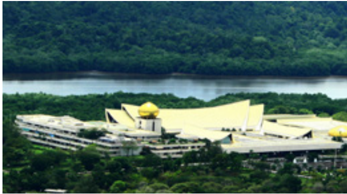
Istana Nurul Iman