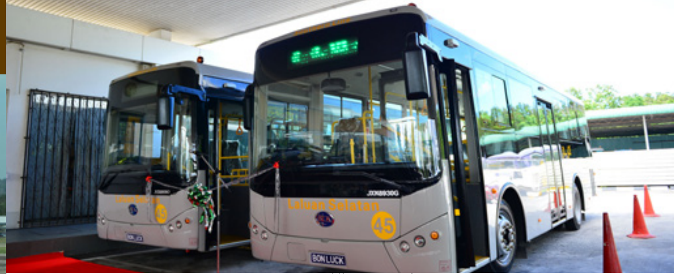
Buses as public transportation

As an added convenience to its passengers, the airline has code-share agreements with a number of airlines