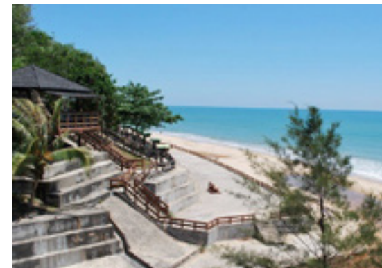
Berakas Forestry Recreational Park

It is 199 hectares wide situated along the Muara-Tutong Highway which is just 10 kilometres from Bandar Seri Begawan. Here you can witness the sun-dappled pathways meanders past sheltered picnic spots and barbeque facilities towards the soaring observation tower, and the tang of salt air hovers above the lush green keranga and casuarina forests that tumble to the edge of the nearby South China Sea.