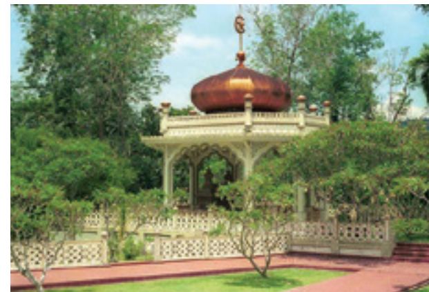
Sultan Bolkiah Mausoleum