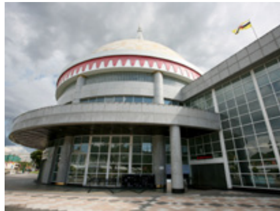
Royal Regalia Building

The Royal Regalia, strategically located in the heart of Bandar Seri Begawan is a building that was established to commemorate the 1992 Silver Jubilee of His Majesty The Sultan and Yang Di-Pertuan of Brunei Darussalam's accession to the throne. The building houses ceremonial regalia including the royal chariot, gold and silver ceremonial armoury, the traditional jewel-encrusted coronation crowns and a replica of the throne used by His Majesty on state occasions.