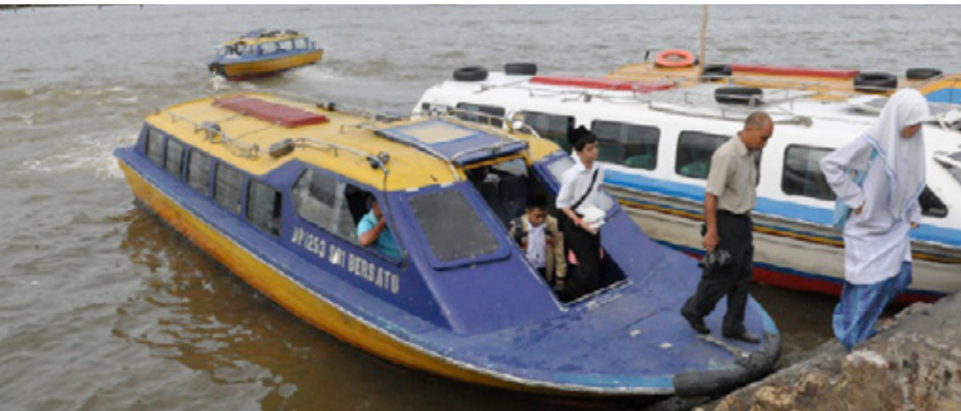
Water taxis in Kampong Ayer area

The Mail Processing Centre (MPC) at the Old Airport Complex in Berakas acts as the processing centre for letters and parcels regardless of categories of mail