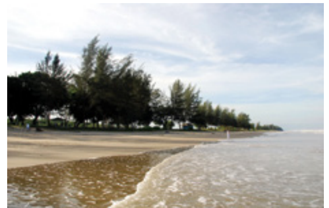
Scenery at Pantai Seri Kenangan

Located close to Bukit Shahbandar Recreational Park are two beaches, namely Tungku Beach and Jerudong Beach. Besides these two beaches, the other famous beaches are Muara and Serasa beaches. These are popular beaches and are well equipped with picnic grounds, changing rooms, restrooms, yacht activities and food stalls.