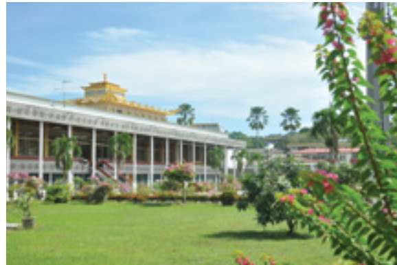
Lapau and Dewan Majlis

The Lapau which contains the Patarana (Throne) and where numerous solemn ceremonies are held is beautifully decorated in exquisite gold motifs. It was here on August 1, 1968 that His Majesty The Sultan and Yang Di-Pertuan of Brunei Darussalam was crowned the 29 th ruler of Brunei Darussalam.