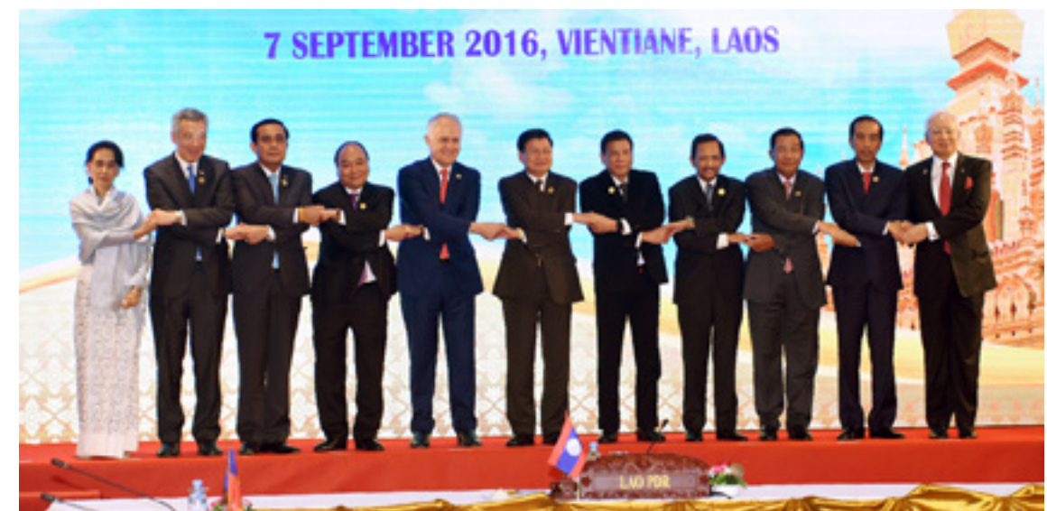
His Majesty The Sultan of Brunei attended the first ASEAN–Australia Biennial Summit

Countries that have diplomatic mission in Brunei Darussalam are fellow members of ASEAN, Britain, the United States of America, Australia, Japan, Republic of Korea, The Federal Republic of Germany, Canada, Pakistan, Bangladesh, France, The Sultanate of Oman, the People's Republic of China, India, Iran and Saudi Arabia. Some 69 other countries have also officially accredited their ambassador to Brunei Darussalam.