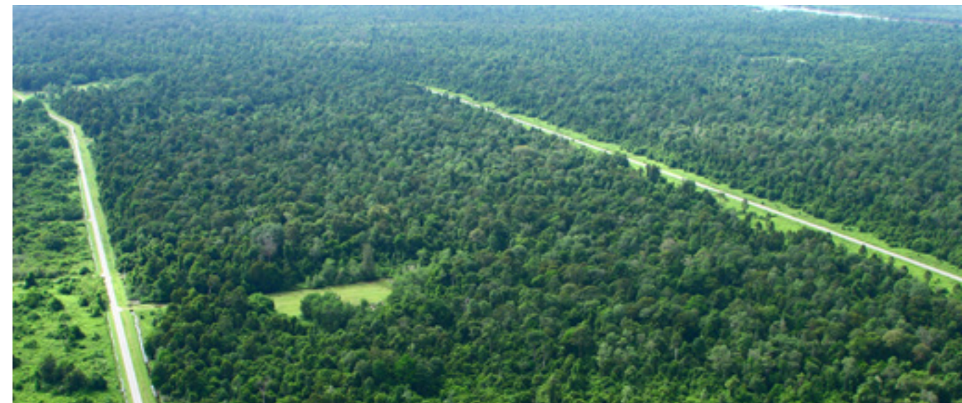
Forests in Brunei Darussalam

In the year 2016, forestry production of round timber and sawn timber amounted to 69,175.15 cubic metres and 41,150.80 cubic metres respectively.