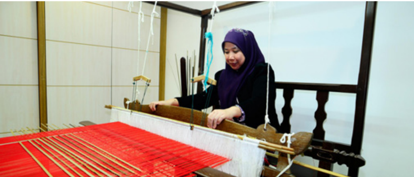
A weaver at the Brunei Arts and handicraft, Training Centre weaving a beautiful cloth commonly known as 'Kain Tenunan Brunei'

Relics and other various artistic heritage besides the ones mentioned above include Malay weaponry, wood carvings, traditional instruments, 'silat' (the traditional art of self-defence) and decorative items for women. Some of these are kept in the Brunei Museum and the Malay Technology Museum, not only for the world to see but also most importantly for today's generation to admire and be proud of for future generation to emulate. Perhaps it is something to remind us of ancestor's natural skill, creativity and innovativeness, which over generations have been ingrained as one of the richest traditional culture in the Malay world.