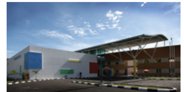
Health Promotion Centre

Located about 10 minutes drive from the capital, the centre was officially opened by His Majesty The Sultan and Yang Di-Pertuan of Brunei Darussalam on November 13, 2008. This centre consists of modern exhibits that features health related items. Besides viewing the modern, attractive and innovative exhibitions, interactive activities are also available.