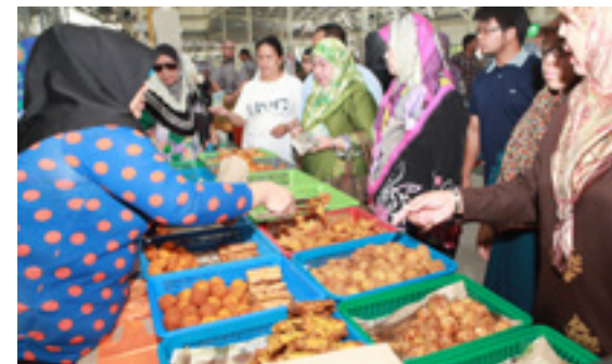
Pasar Pelbagai Barangan Gadong