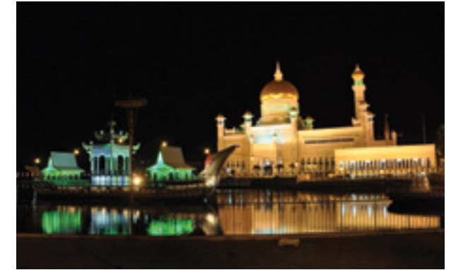
Sultan Omar 'Ali Saifuddien Mosque

There are two great mosques in Bandar Seri Begawan. The first is located at the city centre of Bandar Seri Begawan. It is one of the most magnificent mosques in Southeast Asia, which symbolises Brunei's perpetual adherence to Islam.