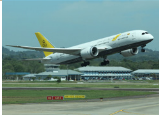
Royal Brunei's Boeing 787 taking off

While the number of passenger movement in the same period was 739,365 inward passengers; 738,837 outward passengers; and 248,659 transit passengers.