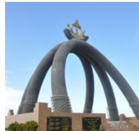
The Billionth Barrel Monument

The Billionth Barrel Monument located in the Belait District memorialises and celebrates the billionth barrel of oil produced in the onshore oil field in Seria, the monument was built in 1991 and was commemorated by Sultan Haji Hassanal Bolkiah Mu'izzaddin Waddaulah ibni Al-Marhum Sultan Haji Omar Ali Saifuddien Sa'adul Kahiri Waddien on 18 July 1991.