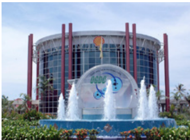
Oil and Gas Discovery Centre

It is located in Pekan Seria, Belait District where it was set up by the Brunei Shell Petroleum with an aim to educate the public on science, technology and the environment.