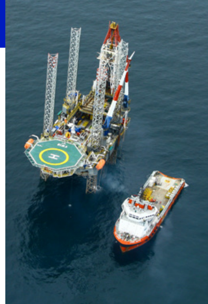
Oil Rig at the South China Sea

In the same period, the oil price was at US$44.63 per barrel per day; while liquefied natural gas was at US$ 7.26 per MMBtu (Million British thermal unit).