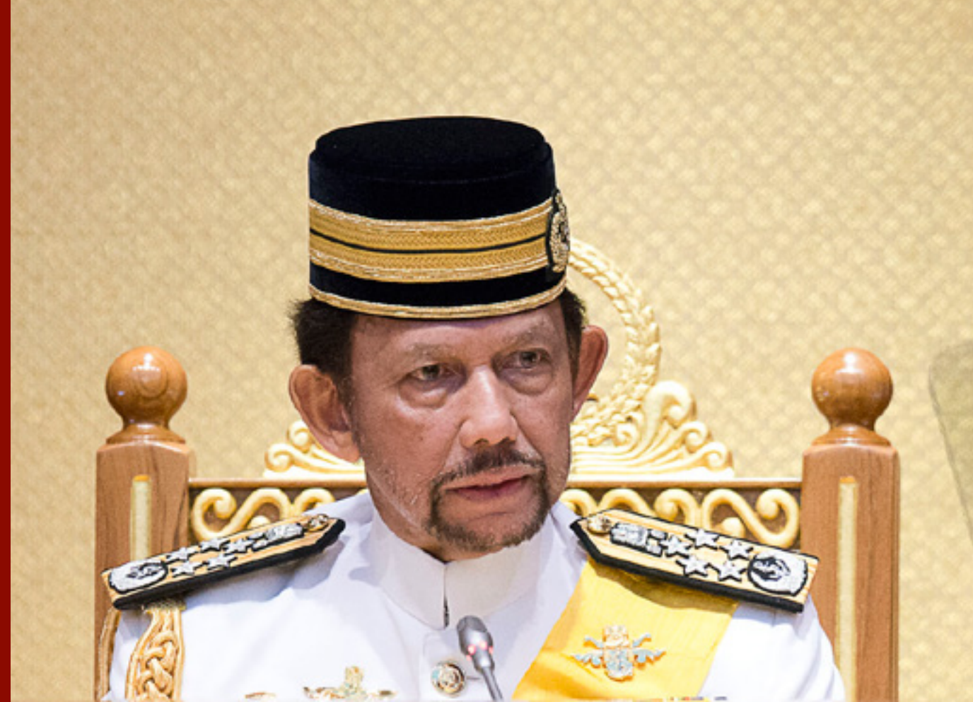
His Majesty Sultan Haji Hassanal Bolkiah Mu'izzaddin Waddaulah ibni Al-Marhum Sultan Haji Omar 'Ali Saifuddien Sa'adul Khairi Waddien, The Sultan and Yang Di-Pertuan of Brunei Darussalam