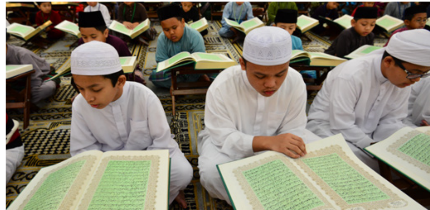
Young children completing the reading of the Al-Quran.

Islam is the official religion of Brunei Darussalam as stated in the written constitution, with His Majesty the Sultan and Yang Di-Pertuan of Brunei Darussalam as the head of the Islamic faith. Thus, Islam plays a central role in the life of every Muslim in Brunei Darussalam. Christianity, Buddhism and other religions are also practised here.