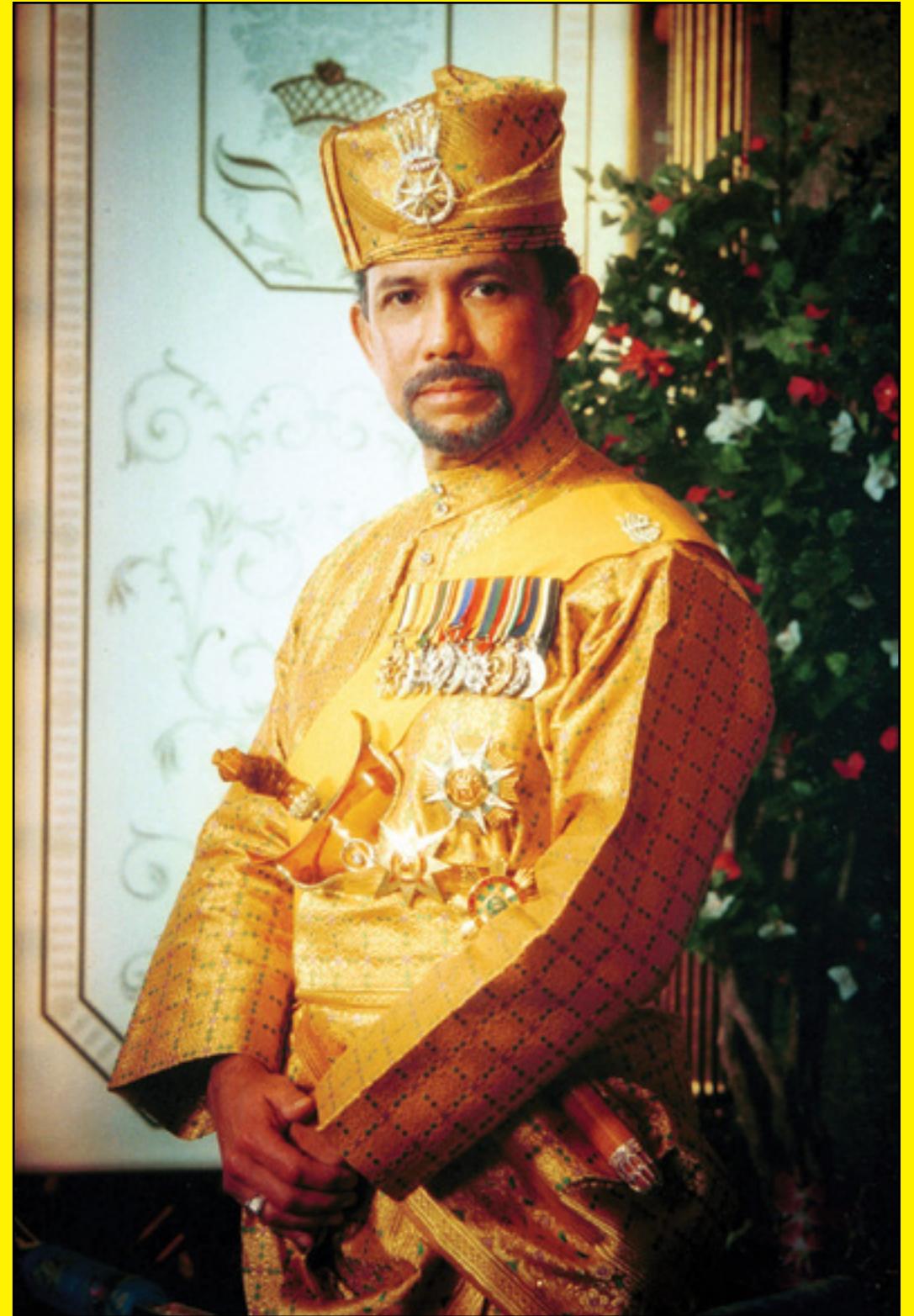
His Majesty Sultan Haji Hassanal Bolkiah Mu'izzaddin Waddaulah ibni Al-Marhum Sultan Haji Omar 'Ali Saifuddien Sa'adul Khairi Waddien, The Sultan and Yang Di-Pertuan of Brunei Darussalam