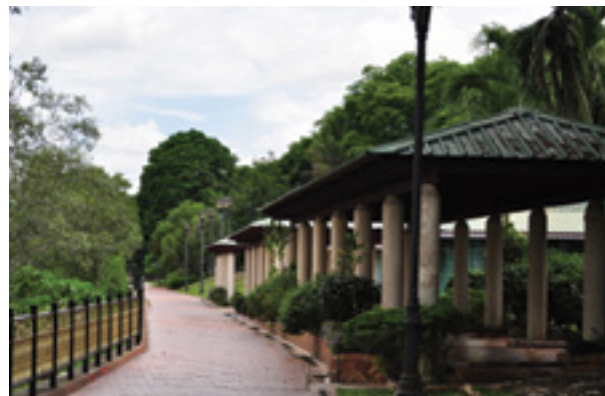
Taman Persiaran Damuan walk path

It is situated next to the Istana Nurul Iman where visitors can get the best view of the palace. Because of the magnificent view of the palace, this park is one of the popular places of interest in Brunei. Taman Persiaran Damuan offers a scenic park along the riverbank off Jalan Tutong, and it is a popular spot for joggers. Other distinctive decorations are the six outdoor sculptures by ASEAN artists.