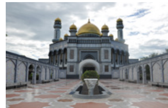
Jame' 'Asr Hassanil Bolkiah Mosque

The second mosque is the Jame' 'Asr Hassanil Bolkiah, which provides a further inspirational example of Islamic architecture in the capital. It was built in 1994 to commemorate the 25 th anniversary of the reign of the 29 th Sultan, His Majesty Sultan Haji Hassanil Bolkiah Mu'izzaddin Waddaulah.