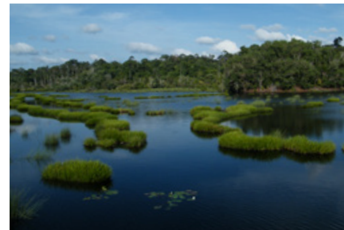
An aerial view of a part of the famous water village locally known as Kampung Ayer (top); Proboscis Monkey, only found in Borneo Island, easily sighted along Brunei River (middle); Tasek Merimbun Heritage Park is one of ASEAN'S national heritage parks (bottom)