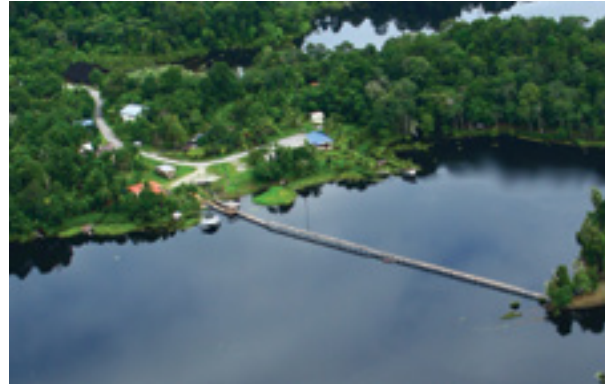
Tasek Merimbun Heritage Park

Located in Tutong District, about one hour and 15 minutes drive from Bandar Seri Begawan, the park aims to provide a safe haven for protected wildlife to breed, preserve flora and fauna and to provide a base for scientific research and study. For those interested in botany or bird watching, there is a jungle trail to explore. The park was declared as one of the ASEAN National Heritage Sites on November 29, 1984.