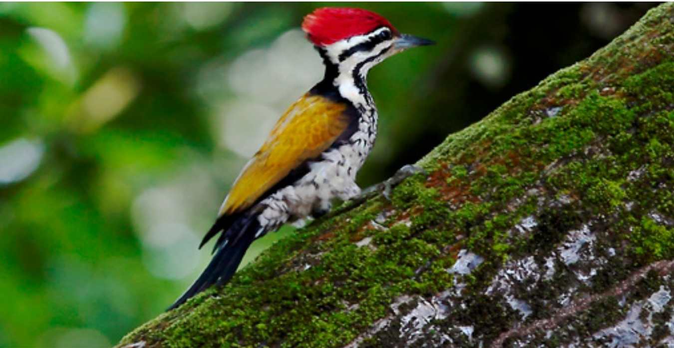
A unique fauna found in Brunei Darussalam.

Brunei Darussalam has a National Herbarium, which has become an important institution of reference. The Brunei National Herbarium (BRUN) plays an important role as the centre for specimens collected in the country and those from neighbouring countries: the Malaysian states of Sabah and Sarawak, Indonesian province of Kalimantan, and Republic of Singapore. BRUN currently houses an impressive specimen collection amounting to nearly more than 29,000 species.