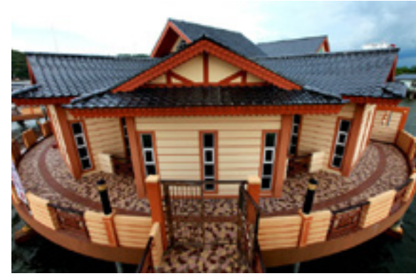
Kampong Ayer Cultural & Tourism Gallery