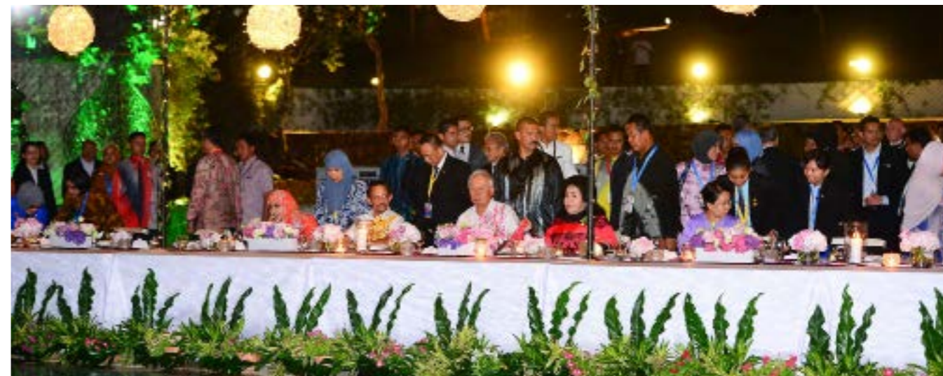
Their Majesties at a dinner reception held at the Westin Hotel in Langkawi.