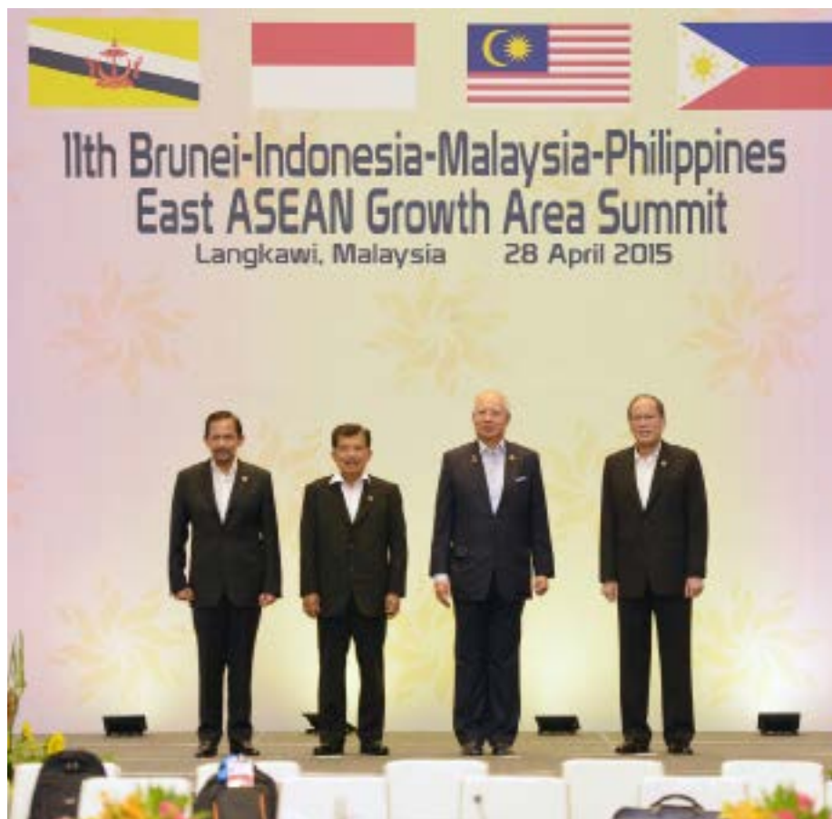
His Majesty with BIMP-EAGA leaders before the start of the 11 th BIMP-EAGA Summit.

Before concluding the titah , His Majesty expressed appreciation to ADB for their continued support in various sectors of cooperation. His Majesty also noted that the BIMP-EAGA has made steady progress in implementing its blueprint since 2012.