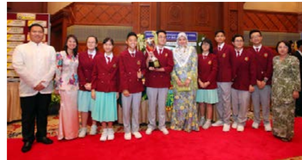
Her Royal Highness with the winners of the PRYNOSA 17.

Earlier, Her Royal Highness was greeted upon arrival by the Minister of Industry and Primary