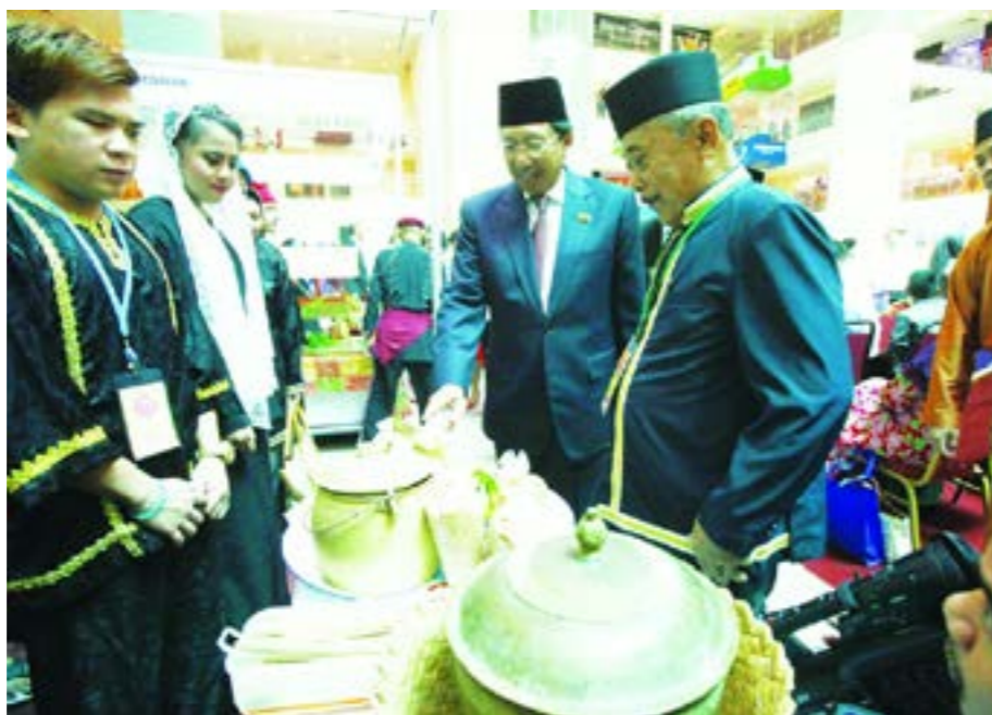
The Minister of Culture, Youth and Sports viewing the cultural exhibition at the Airport Mall in Berakas.

He noted that the objectives of the festival are to introduce to the public the uniqueness of Brunei's seven ethnic groups, enhance a sense of friendship and understanding through culture and arts interaction as well as to expand network in the context of multilateral