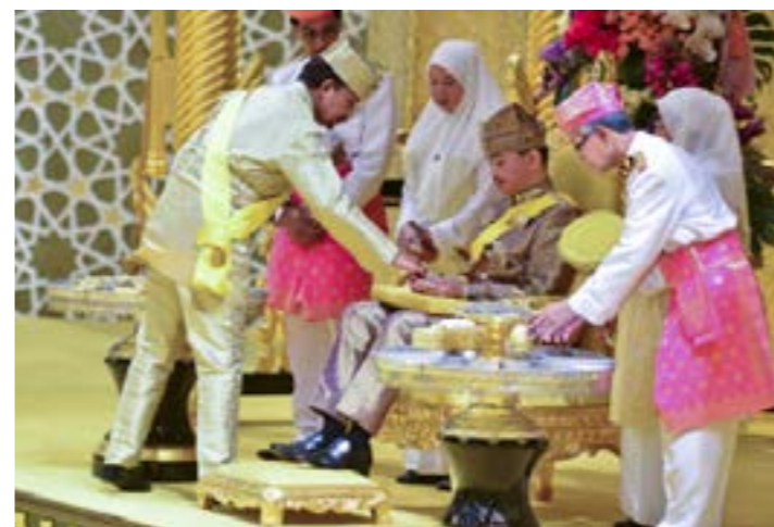
His Majesty applying powder paste on the palms of His Royal Highness during the 'Istiadat Berbedak Pengantin Diraja', or the royal powdering ceremony at Istana Nurul Iman.

*Continued from page 4 (Their Majesties graces royal wedding ceremony)