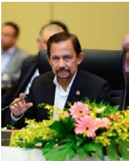
His Majesty at the 11 th BIMP-EAGA Summit in Langkawi.