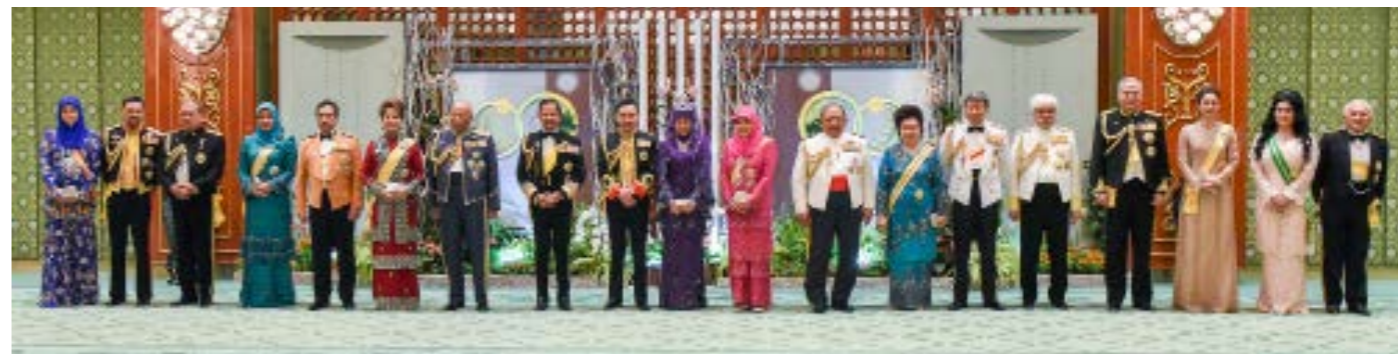
His Majesty receives in audience the special guests at the Istana Nurul Iman.