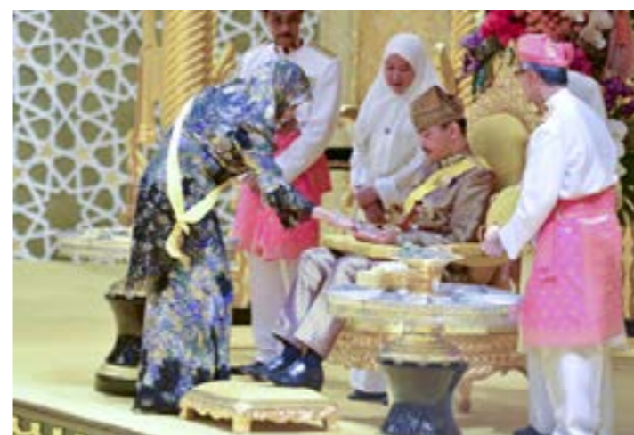
Her Majesty applying powder paste on the palms of His Royal Highness.