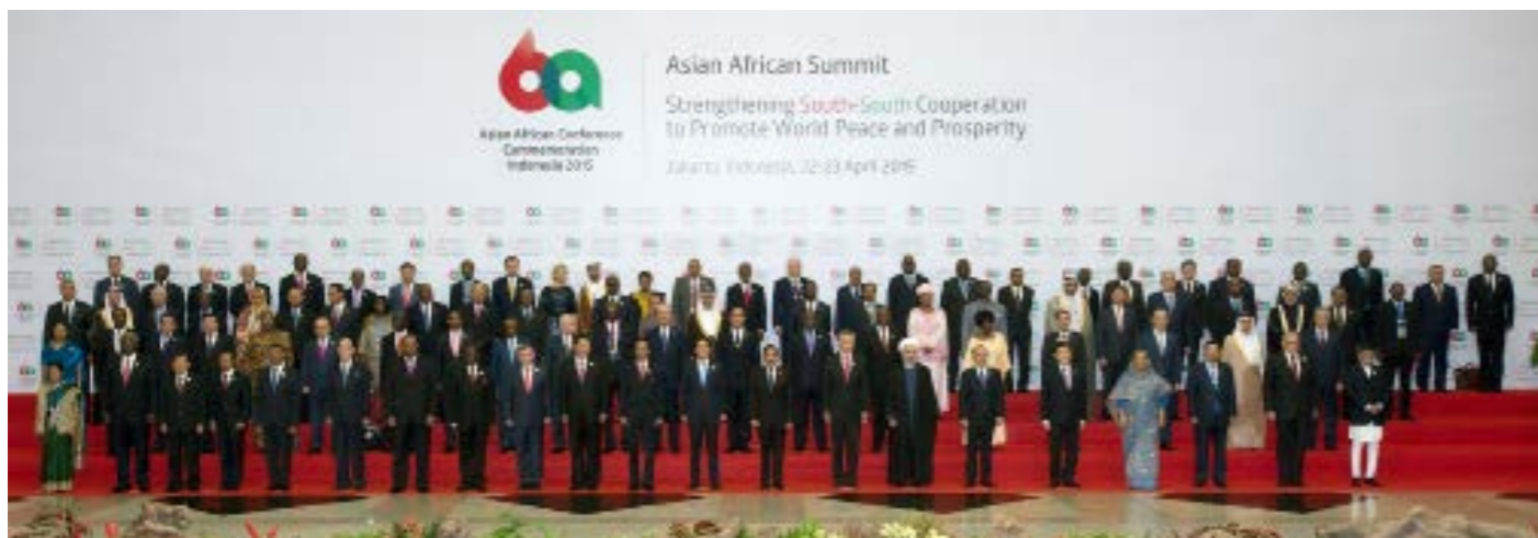
His Majesty with leaders at the Asian African Summit and the Asian African Conference Commemoration in Jakarta.