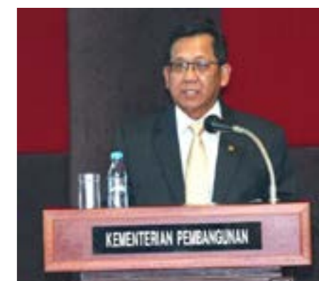
The Minister of Development delivering a speech at the water seminar held in conjunction with World Water Day 2015 at the Ministry of Development Training Centre.

"In Brunei, we have worked hard to achieve Millennium Development Goal before 2010 in water supply with