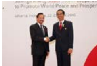
1 His Majesty attends Asian African Conference Commemoration 2015