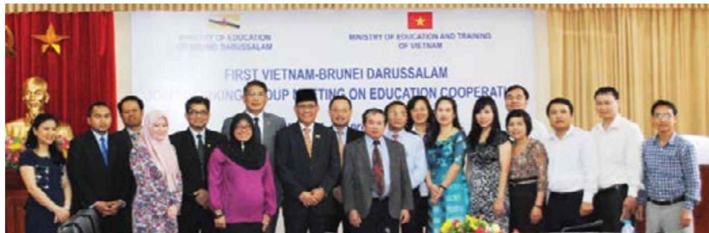
The Deputy Minister at the first Joint-Working Group Meeting between the Ministry of Education of Brunei Darussalam and the Ministry of Education and Training of the Socialist Republic of Vietnam in Hanoi.

The Joint-Working Group meeting is the outcome of the Memorandum of Understanding that was signed by both countries in the Brunei Darussalam on April 9, 2014.