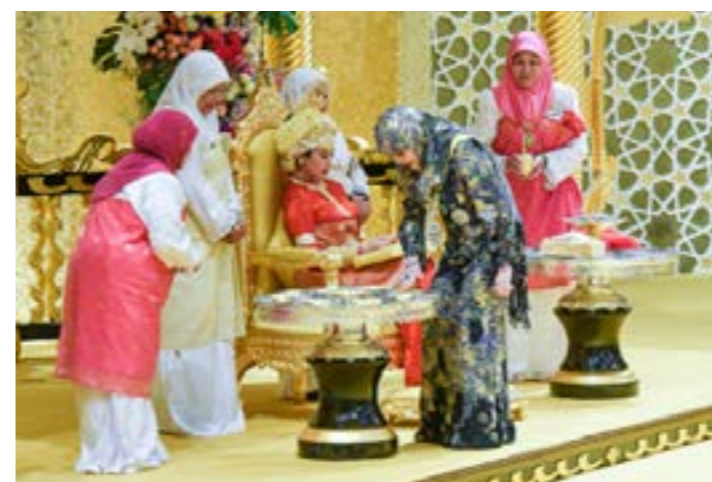
Her Majesty taking powder paste to apply on the palms of Yang Amat Mulia Pengiran Anak Isteri.