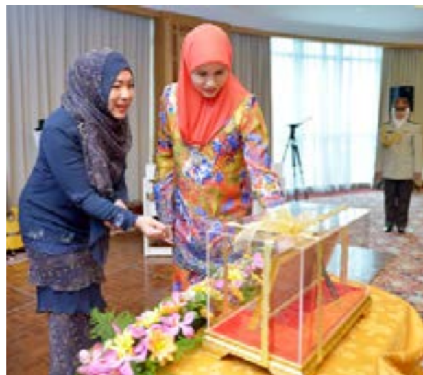
Her Royal Highness receives a pesambah (gift) from BLGA Vice-Chairperson.