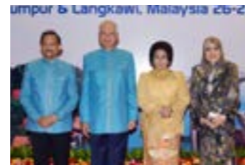
8 Their Majesties attend 29th ASEAN Summit Gala Dinner