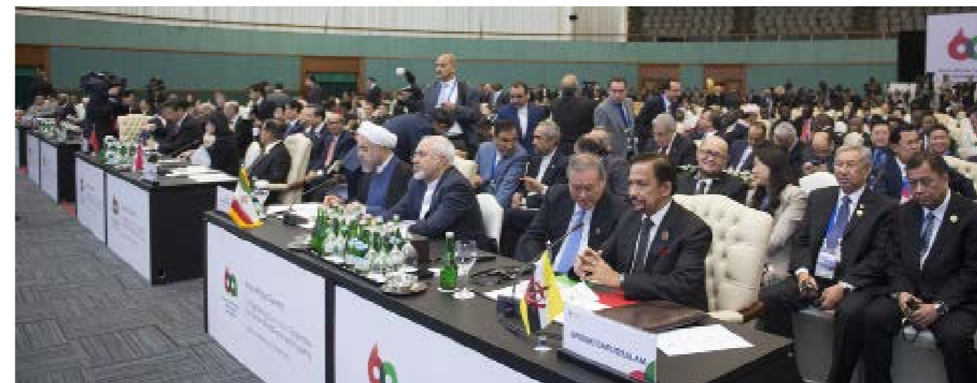
His Majesty with the Minister of Finance II at the Asian African Summit and the Asian African Conference Commemoration.