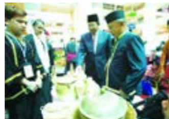
18 Ministry of Culture, Youth and Sports to offer cultural courses for youth