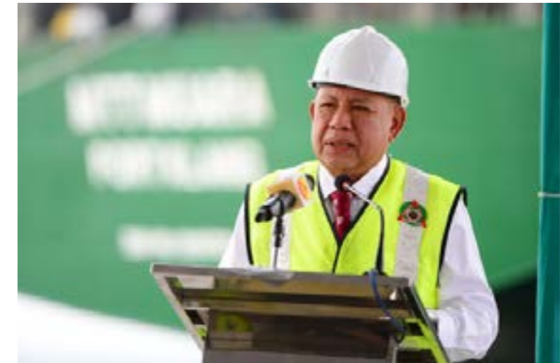
The Minister of Communications delivering a speech at the welcoming ceremony of the maiden voyage of a new container ship, the MV MTT Muara.

In the speech, the minister highlighted a number of initiatives the ministry is currently implementing, which he believes