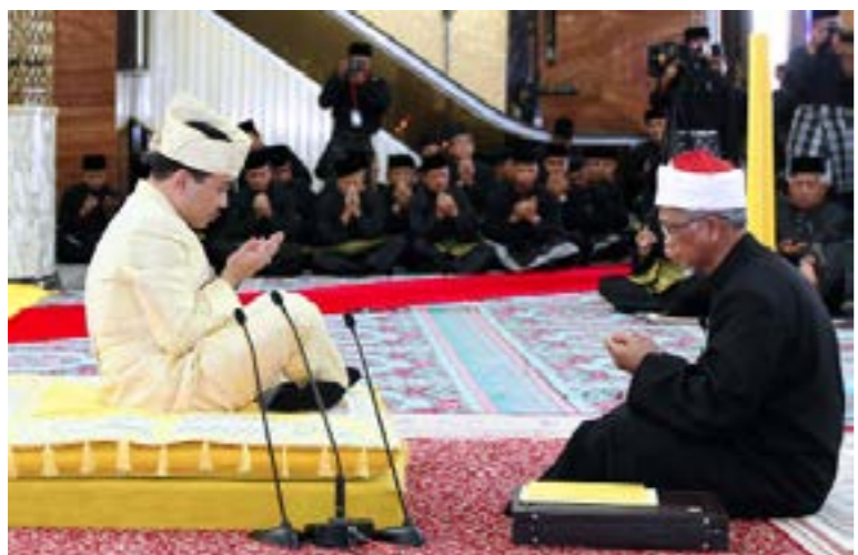
His Royal Highness during the 'Istiadat Akad Nikah Diraja', or the solemnisation ceremony held at Sultan Omar 'Ali Saifuddin Mosque