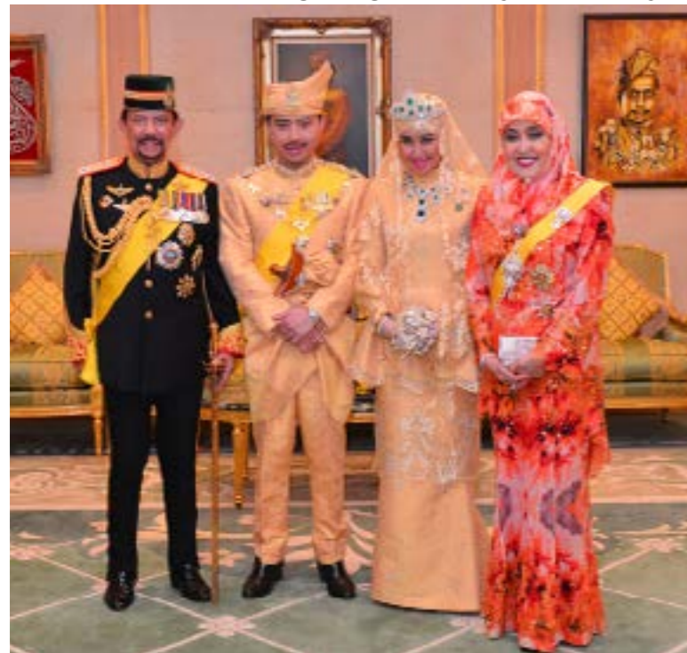
Their Majesties with the royal couple.