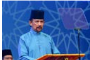
10 His Majesty graces National Al-Quran Reading Competition for Adults 1436 Hijrah/2015