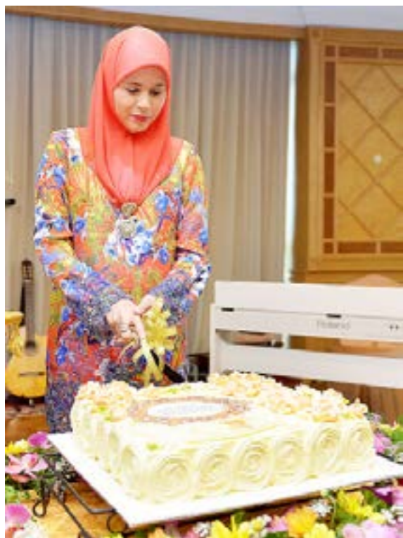
Her Royal Highness cutting a birthday cake to commemorate the occasion.