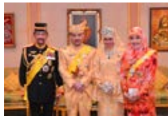
4 Their Majesties grace royal wedding ceremony