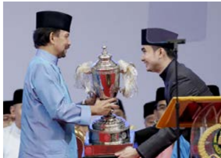
His Majesty presents a trophy to one of the winners.

In the titah , His Majesty also congratulated the participants of this year's National Al-Quran Reading