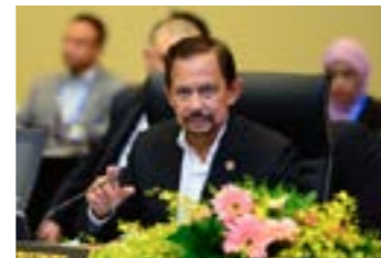
20 His Majesty calls for greater environmental work at 11th BIMPE-EAGA Summit