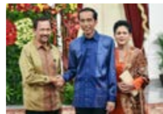
6 His Majesty attends dinner reception at Istana Negara