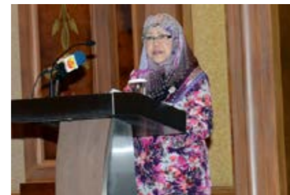
Her Royal Highness delivering a speech at the opening ceremony of the conference at the Empire Hotel and Country Club.

BANDAR SERI BEGAWAN, April 30 – Her Royal Highness Prince Hajah Masna binti Al-Marhum Sultan Haji Omar 'Ali Saifuddin Sa'adul Khairi Waddien, the Acting Minister of Foreign Affairs and Trade, consented to officiate the opening ceremony of the 4 th Annual Executive Secretaries and Administrative Professionals Conference 2015 at the Empire Hotel and Country Club.