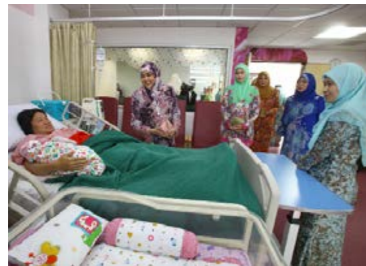
Her Majesty and members of the royal family meeting a patient.