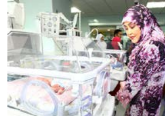
Her Majesty tours the new centre at the launching ceremony.

The Minister of Education, The Honourable Pehin Orang Kaya Seri Kerna Dato Seri Setia Dr. Haji Awang Abu Bakar bin Haji Apong; the Minister of Development, The Honourable Pehin Orang Kaya Indera Pahlawan Dato Seri Setia Awang Haji Suyoi bin Haji Osman; the Minister of Industry and Primary Resources, The Honourable Pehin Orang Kaya Seri Utama Dato Seri Setia Awang Haji Yahya bin Begawan Mudim Dato Paduka Haji Bakar; the Minister of Culture, Youth and Sports, The Honourable Pehin Orang Kaya Pekerma Laila Diraja Dato Seri Setia Awang Haji Hazair bin Haji Abdullah and the Deputy Minister of Finance, Yang Mulia Dato Paduka Awang Haji Bahrin bin Abdullah were also present at the event.