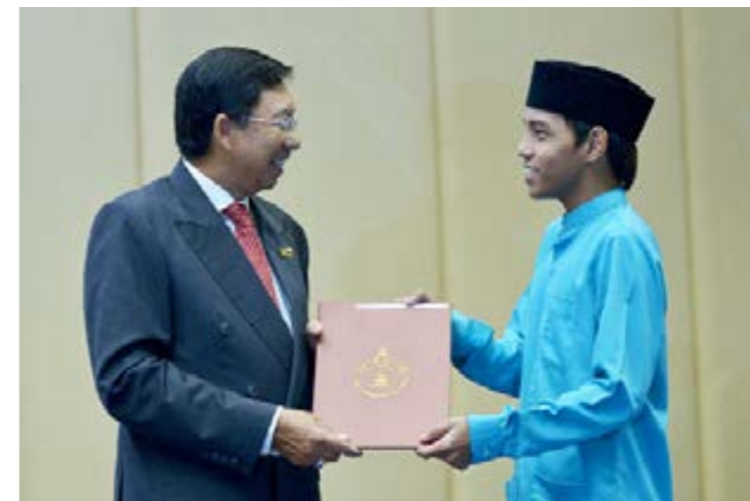
The Minister of Culture, Youth and Sports presenting a certificate to one of programme's participants.

The ceremony concluded with a slideshow presentation of the programme's activities and the presentation of certificates to the participants.