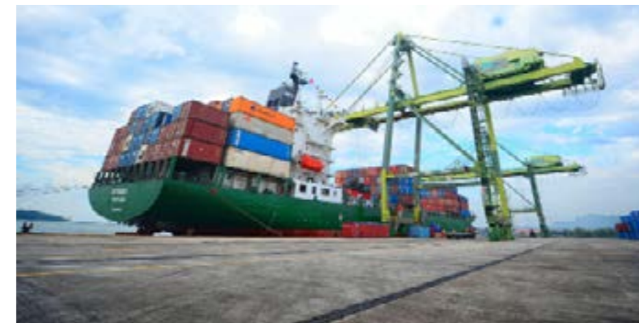
The MV MTT Muara at Muara Port.

These projects and initiatives would support major industrial and infrastructural development being implemented in the country such as a pharmaceutical manufacturing plant, the bio-innovation corridor, huge housing projects and the upcoming construction of an oil refinery in Pulau Muara Besar, he added.