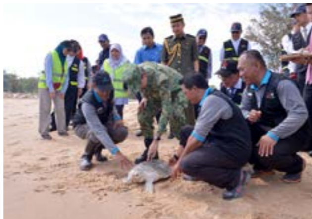
His Royal Highness The Crown Prince and Senior Minister at the Prime Minister's Office releasing a turtle during the working visit.

Prospective research includes turtle and coral conservation with the Marine Biodiversity Centre of the Ministry of Industry and Primary