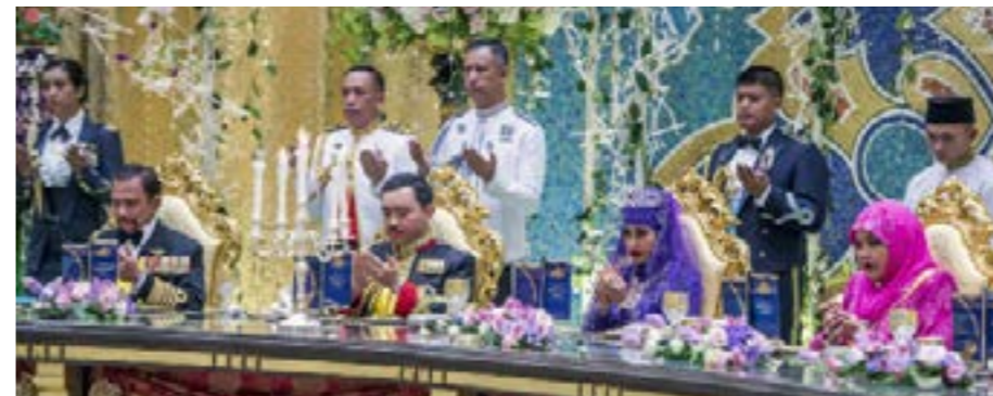
Their Majesties and the royal couple (left) with the special guests (below) at the 'Istiadat Persantapan Pengantin Diraja' ceremony (below).

Majesty Sultan Haji Hassanal Bolkiah Mu'izzaddin Waddaulah; Her Royal Highness Princess Hajah Muta-Wakkilah Hayatul Bolkiah binti His Majesty Sultan Haji Hassanal Bolkiah Mu'izzaddin Waddaulah; Her Royal Highness Princess Hajah Majeedah Nuurul Bolkiah binti His Majesty Sultan Haji Hassanal Bolkiah Mu'izzaddin Waddaulah; Her Royal Highness Princess 'Azemah Ni'matul Bolkiah binti His Majesty Sultan Haji Hassanal Bolkiah Mu'izzaddin Waddaulah; Her Royal Highness Princess Fadzillah Lubabul Bolkiah binti His Majesty Sultan Haji Hassanal Bolkiah Mu'izzaddin Waddaulah; Her Royal Highness Princess Ameerah Wardatul Bolkiah binti His Majesty Sultan Haji Hassanal Bolkiah Mu'izzaddin Waddaulah; Her Royal Highness Princess Hajah Masna binti Al-Marhum Sultan Haji Omar 'Ali Saifuddien Sa'adul Khairi Waddien, Her Royal Highness Princess Hajah Nor'ain binti Al-Marhum Sultan Haji Omar 'Ali Saifuddien Sa'adul Khairi Waddien, Her Royal Highness Princess Hajah Amal Umi Kalthum Al-Islam binti Al-