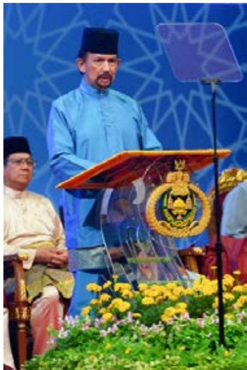
His Majesty delivering a titah (royal speech) at the National Al-Quran Reading Competition for Adults finals at the International Convention Centre.