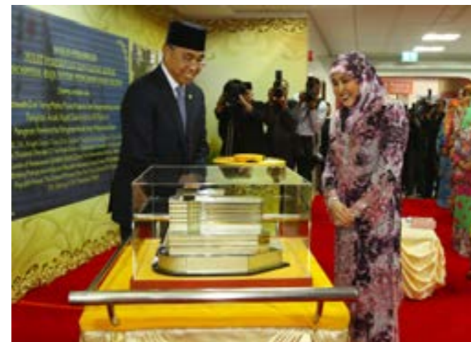
Her Majesty receives a pesambah (gift) from the Women and Children's Centre Executive Committee.

Earlier, His Majesty was greeted by upon arrival by the Minister of Religious Affairs as well as other members of the organising committee.