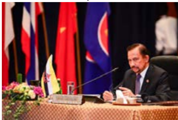
His Majesty at the plenary session of the 26 th ASEAN Summit.