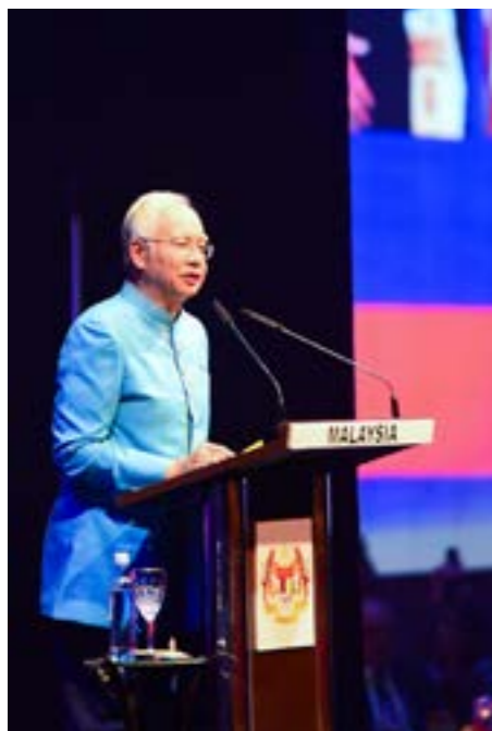
The Prime Minister of Malaysia delivering a speech.