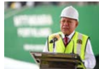
17 Minister: Growth of transportation sector vital in supporting Brunei Darussalam's economy