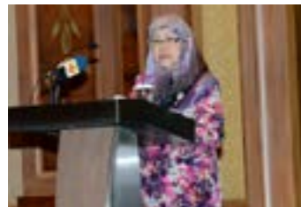
15 HRH officiates 4th Annual Executive Secretaries and Administrative Professionals Conference