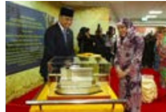
11 Her Majesty launches new Women and Children's Centre at RIPASA Hospital