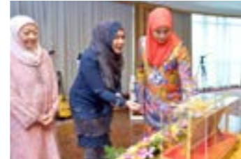
14 Her Royal Highness attends birthday celebration hosted by BLGA