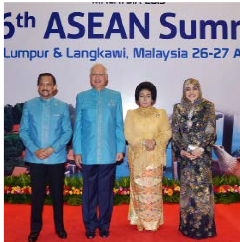
Their Majesties with the Prime Minister of Malaysia and spouse at the gala dinner held at the Kuala Lumpur Convention Centre.

During the reception, the Prime Minister of Malaysia delivered his remarks welcoming all leaders and delegates attending the 26 th ASEAN Summit in Kuala Lumpur. The gala dinner was also graced with musical performances.