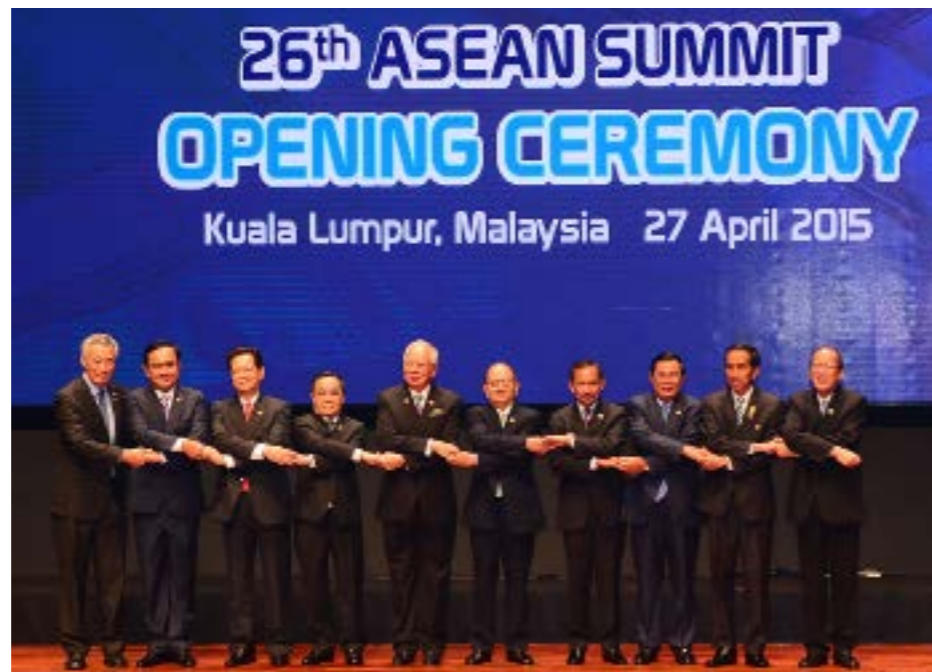
His Majesty with heads of states and governments at the opening ceremony of the 26 th ASEAN Summit.