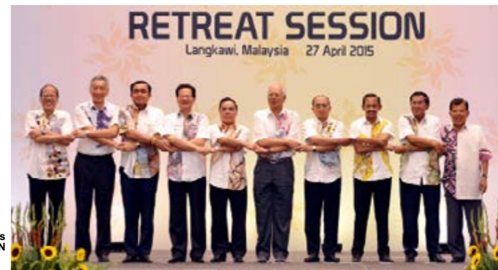
His Majesty with heads of states and governments at the 26 th ASEAN Summit Retreat Session in Langkawi.