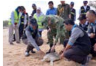
12 His Royal Highness The Crown Prince visits RKN10 sites