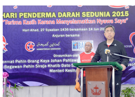
18 Ministry of Health holds Family Blood Donor Day