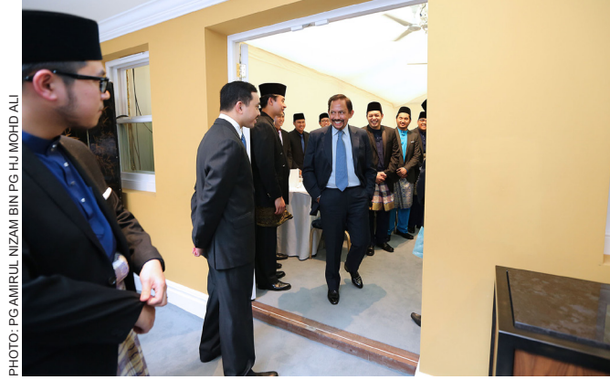
His Majesty with the government officials and Bruneian