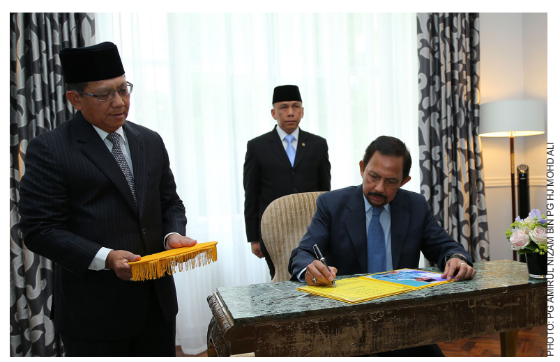
children of Brunei High Commission officials in London His Majesty signs a parchment for the officiating ceremony of the launching of the Brunei House.