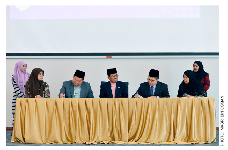
The Minister of Religious Affairs witnessing the signing of the MoU between the Ministry of Religious Affairs and BIBD.

The Deputy Minister of Religious Affairs Yang Mulia Pengiran Dato Paduka Haji Bahrom bin Pengiran Haji Bahar, deputy permanent secretaries, directors and heads of departments of at the ministry, members of the BIBD Board of Directors, Syariah Advisory Body and BIBD management were also present at the ceremony.