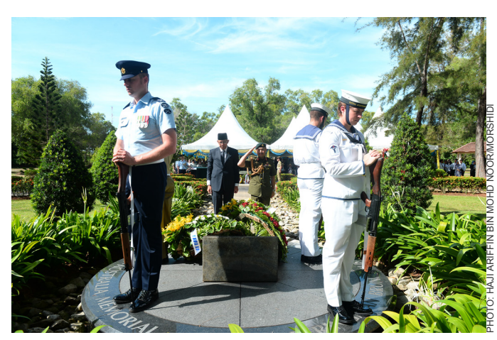
Wreaths are laid down for the fallen heroes.

A monument was also build by the people of Beaufort in honour of Starcevich.