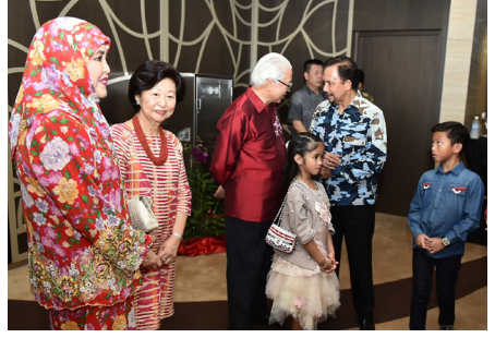
5 Their Majesties graces 28th SEA Games opening ceremony