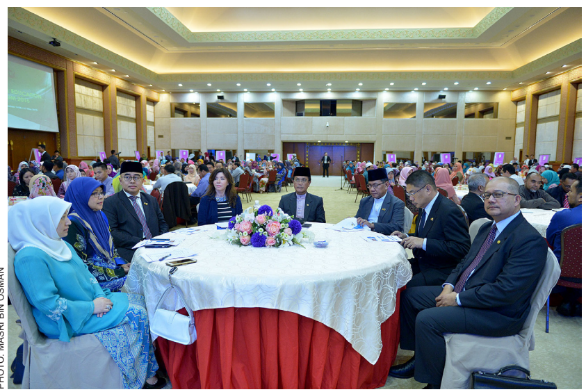
The Ministry of Education at the National Education Forum: Leadership for Learning at the International Convention Centre in Berakas.

BANDAR SERI BEGAWAN, May 27 – A total of 418 teachers and school leaders across the country gathered for the National Education Forum: Leadership for Learning 2015 at the International Convention Centre in Berakas.