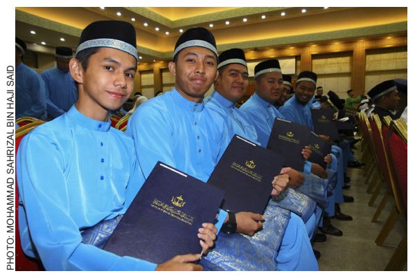
A total of 256 technical and vocational students graduated this year.