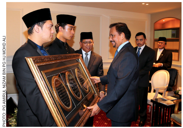
His Majesty receives a pesambah (gift).