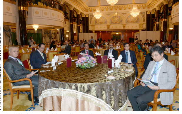
The Ministry of Education at the 5th International Cardiology Conference at the International Convention

Since its establishment on January 1, 2007, UNISSA has continued to actively build cooperation with strategic partners through agreements signed with various institutions of higher education institutions regionally and internationally.