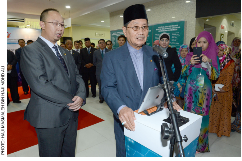
The Minister of Home Affairs at the launch of the Electronic Labour Exchange System.

BANDAR SERI BEGAWAN, June 20 -The Government of His Majesty Sultan Haji Hassanal Bolkiah Mu'izzaddin Waddaulah ibni Al-Marhum Sultan Haji Omar 'Ali Saifuddien Sa'adul Khairi Waddien, The Sultan and Yang Di-Pertuan of Brunei Darussalam's efforts to create a job market atmosphere for the citizens and permanent residents in the country can be expanded by developing good relationship between employers and job-seekers as well as the government.