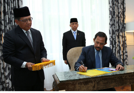
6 His Majesty launches new refurbished Brunei House in