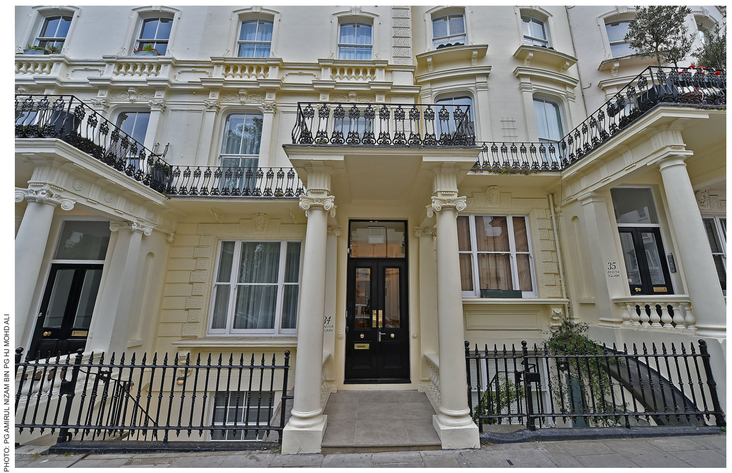
The guesthouse includes 15 en-suite bedrooms, kitchen, dining area, laundry room, office, garden, prayer hall and ablution area for men and women.