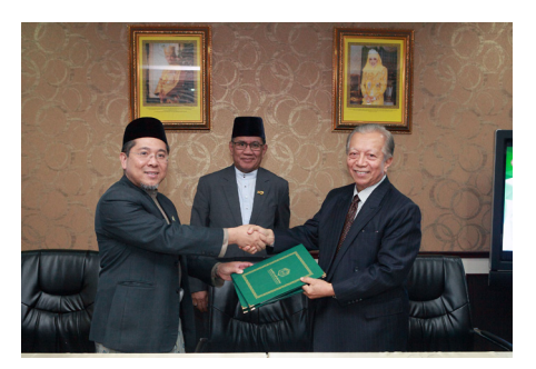
12 UNISSA signs MoU with UIM