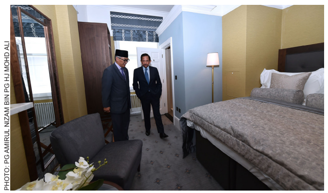
His Majesty touring an en-suite bedroom.