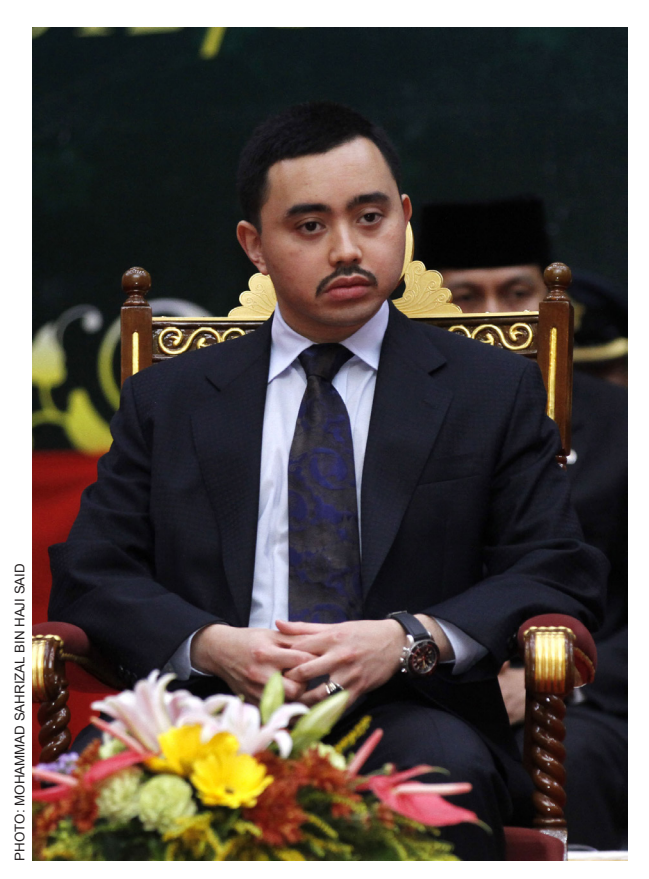
His Royal Highness Prince 'Abdul Malik at the official distribution of the dates' ceremony.

guidance for mankind and clear proofs for the guidance and the criterion (between right and wrong).