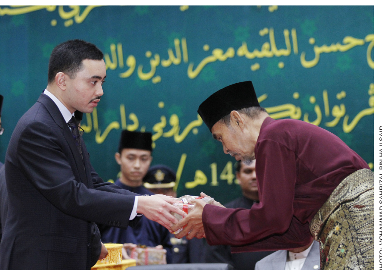
His Royal Highness distributing His Majesty's Personal Gifts of Dates.

The month of Ramadan in which was revealed the Al-Qur'an, a