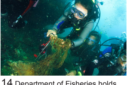
14 Department of Fisheries holds coral cleaning campaign