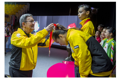
8 Brunei Darussalam wins two wushu bronze medals

is published monthly by the Department of Information. It reports on government, social and business events in the country. All money values are expressed in Brunei dollars $, unless otherwise stated. Any information in this newsletter may be reproduced; a clipping of the publication would be appreciated. For free subscription (excluding postage) please write to the Distribution Unit, Department of Information, Prime Minister's Office, Old Airport, Berakas BB 3510, Brunei Darussalam.