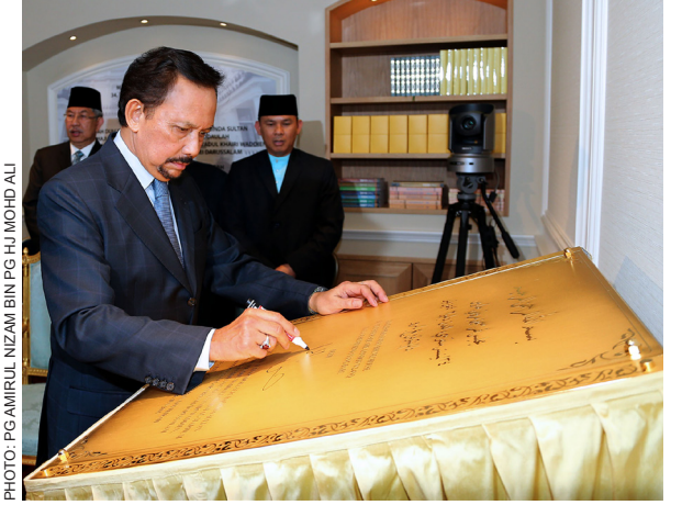
His Majesty signing the plaque of the Brunei House.