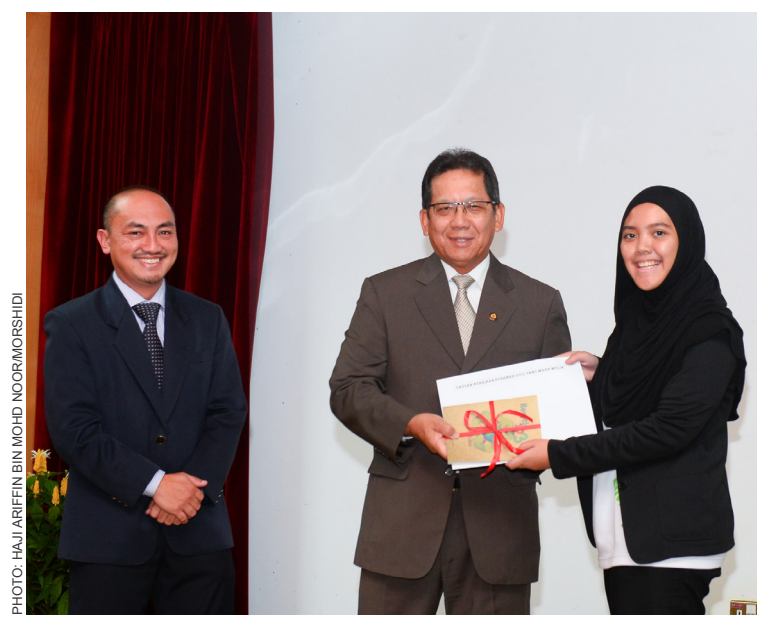
The Minister of Development hands over a recycling guide.

BANDAR SERI BEGAWAN, June 6 – The Ministry of Development, through the Department of Environment, Parks and Recreation, launched a handbook on recycling as part of the efforts to raise public awareness on preserving the environment.