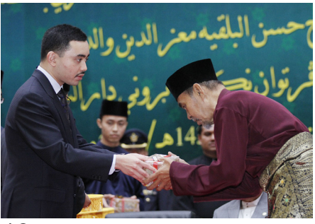
10 His Royal Highness distributes His Majesty's Personal Gifts of Dates