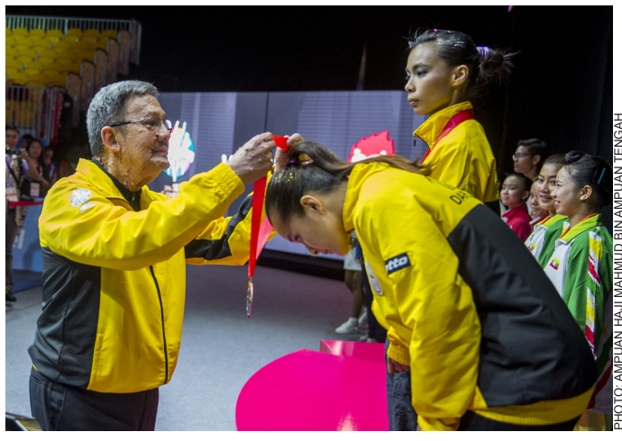
His Royal Highness Prince Haji Sufri Bolkiah presents a medal to one of the winners at the Singapore Expo Hali.

In the women's event, the Republic of the Union of Myanmar secured gold with a score of 9.69, 0.1 points ahead of the Republic of Singapore.