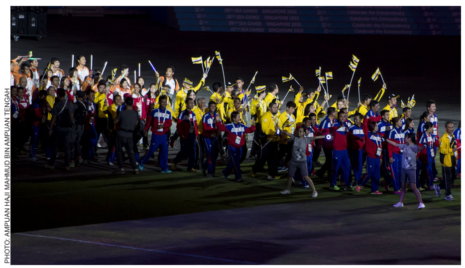
The Brunei contingent at the closing ceremony of the 28th SEA Games.

Malaysia is ranked fourth at the Games this year and will host the next edition of the SEA Games in 2017.