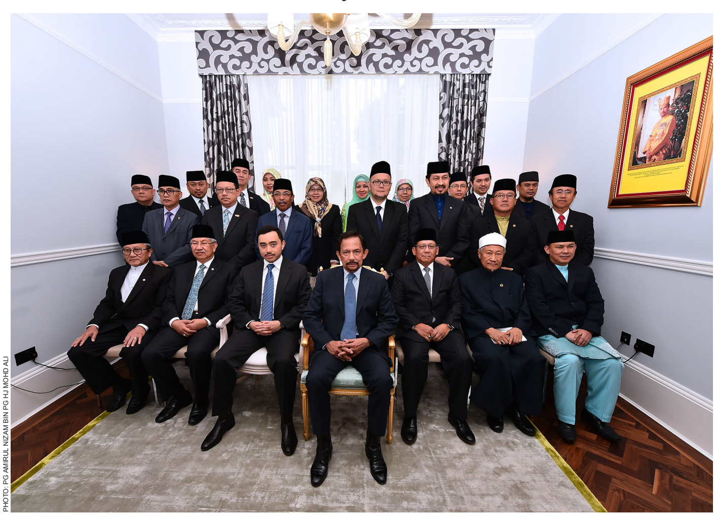
His Majesty with the committee members of the launching ceremony of the refurbished Brunei House.